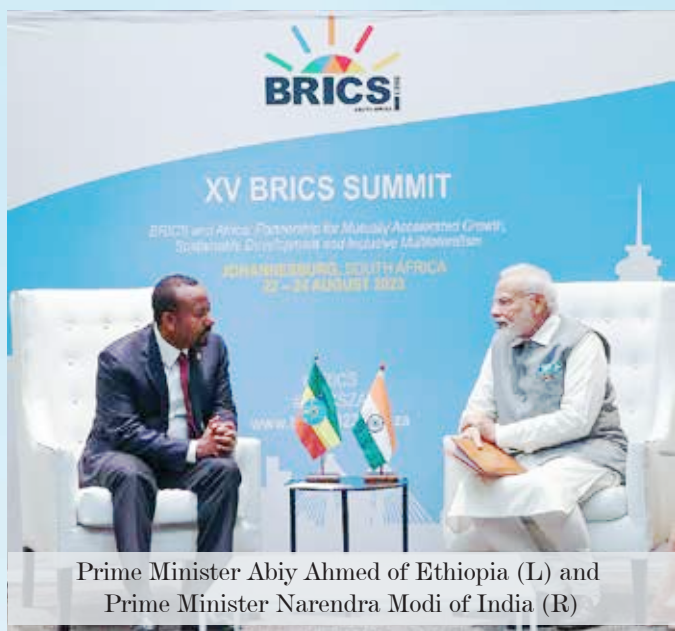
Prime Minister Abiy Ahmed of Ethiopia (L) and Prime Minister Narendra Modi of India (R)

In a series of high-profile meetings and events, Ambassador Demeke has been a tireless advocate for