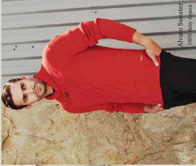
Alvaro Sweater 100% Baby Alpaca

JJ Enterprises is proud to be the official representative of Anntarah in India, bringing you the finest Alpaca wool products directly from Peru