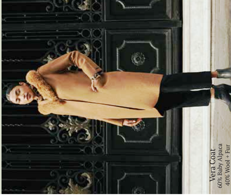
Vera Coat 60% Baby Alpaca 40% Wool + Fur