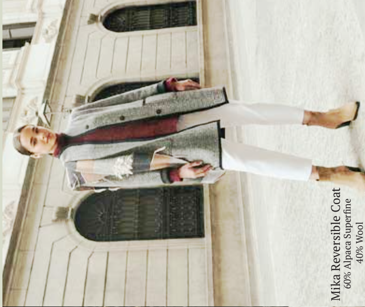
Mika Reversible Coat 60% Alpaca Superfine 40% Wool