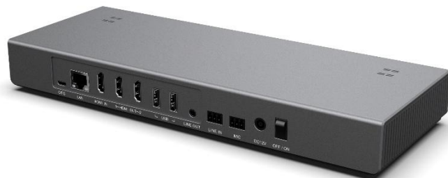
Figure 3: C20 Back