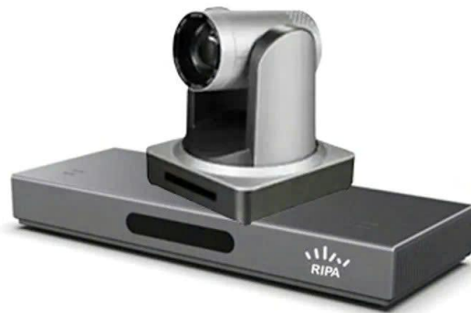
Figure 1: C20 Intelligent Meeting Orchestrator

C20 is ideally used in the meeting room where a dual display panel and single camera is present for huddle and medium room to communicate with remote meeting participants.