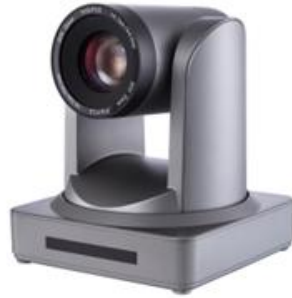
Figure 4: Camera