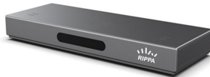
Figure 1 C20 Intelligent Meeting Orchestrator

C20 is ideally used in the meeting room where dual display panels and single camera are installed to communicate with remote meeting participants.