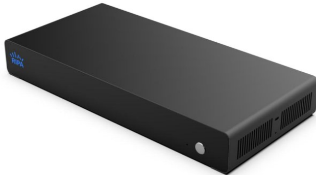
Figure 1: C60 Intelligent Meeting Orchestrator

Ripa C60 is the only SIP/H323 CODEC in the market offers third-party extensibility. Both Ripa and third-party developers are taking advantage of C60's powerful API to innovate large number of value-add features. Today, Ripa C60 offers AI driven video gesture control, intelligent voice and group tracking. In future, Ripa is planning to develop AI enabled multi camera orchestration, natural voice activation and others features.