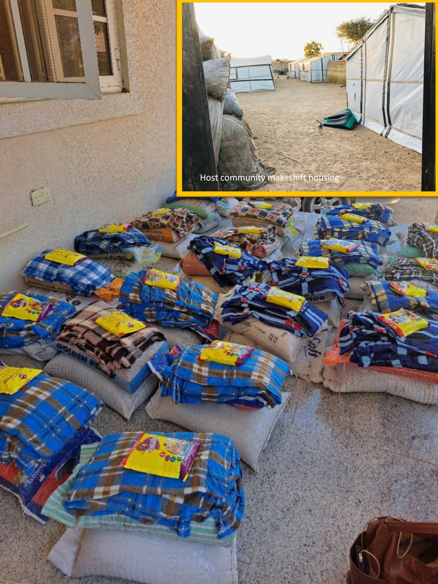
Host community makeshift housing