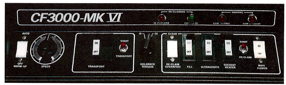
Simplified control panel features switches that are also circuit breakers... A single switch converts the system from cleaning cycle to reclamation cycle.

Because this is a virtually closed system, even the air used to dry the film is captured and re-used.