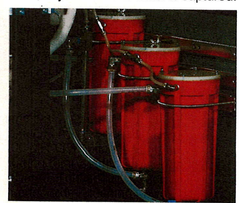
Purification system includes a water separator and desiccant filters.

The first stage is water separation. Next, the solvent passes through a special desiccant — the second and third stage. Here, any last trace of water is captured.