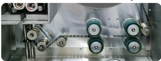
Motorized PTR Arm Threading