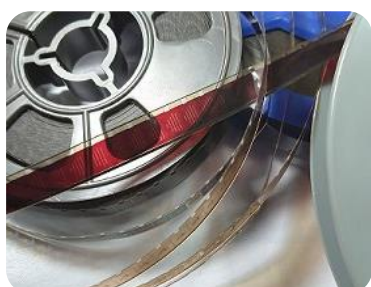
8mm/Super 8mm option