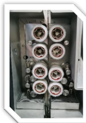
Motorized Wet Buffer Engagement