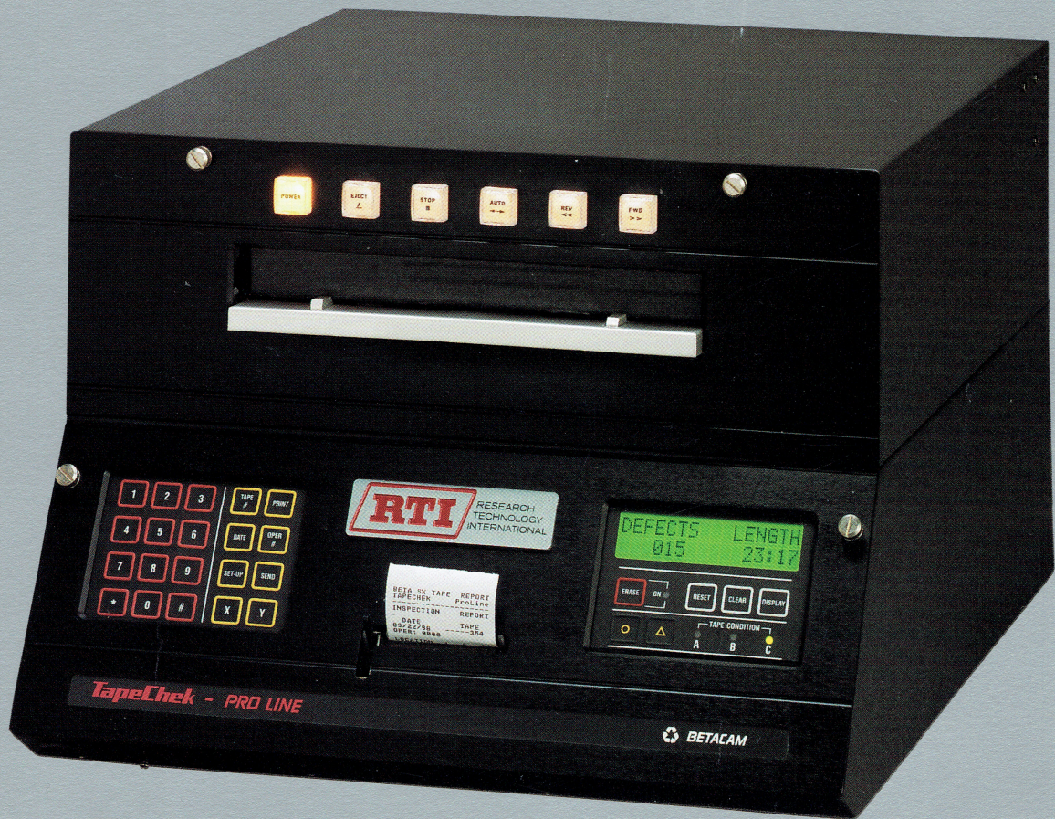
Pro Line 4100 Cleaner-Evaluator-Erasure