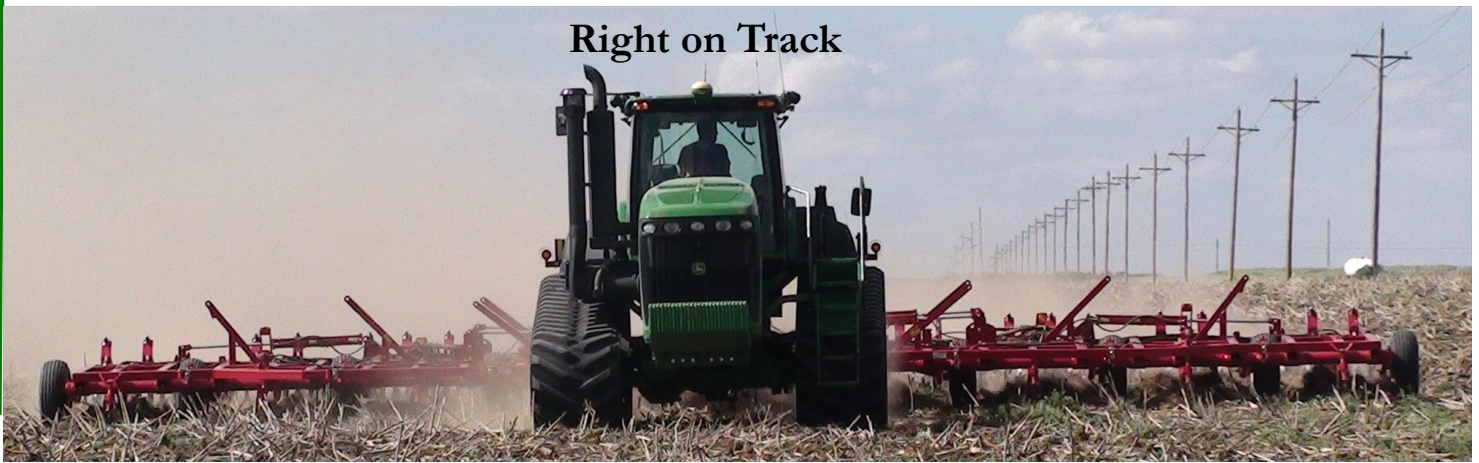
Right on Track