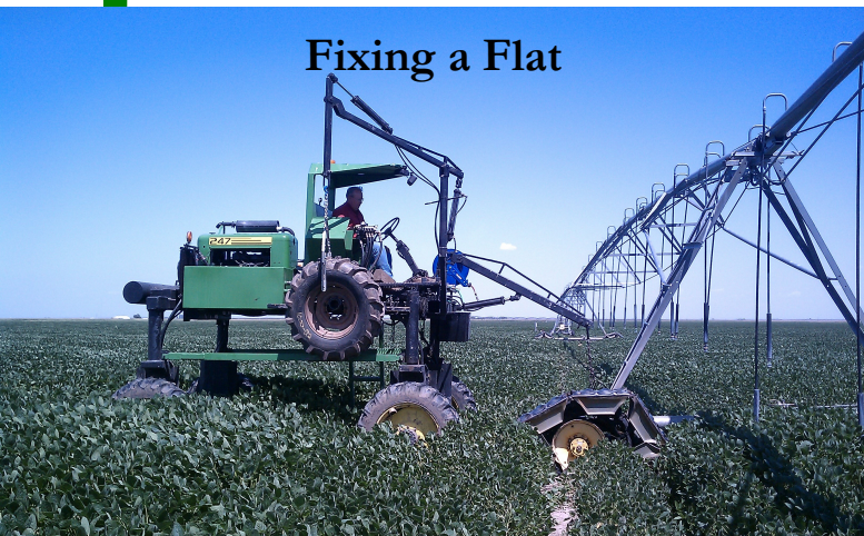
Fixing a Flat