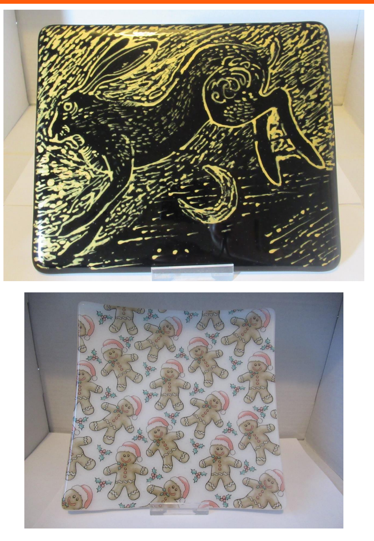
Artist's note: All the pieces here are hand-painted or powder-painted and the tree is kiln-carved, so it is indented on one side. My website is: <u>https://www.amandahillglass.co.uk</u>