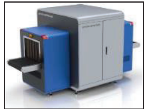
Figure 1. TSA CT System

In November 2017, to address capability gaps in carry-on bag screening, TSA initiated the Checkpoint Property Screening System (CPSS) program. The purpose of the CPSS program is to replace over 2,000 AT X-ray systems with enhanced three-dimensional computed tomography (CT) systems to detect a broader range of explosives and improve passenger experience by no longer requiring removal of liquids and laptops from carry-on bags. Figure 1 depicts a CT system used to screen baggage at passenger screening checkpoints.