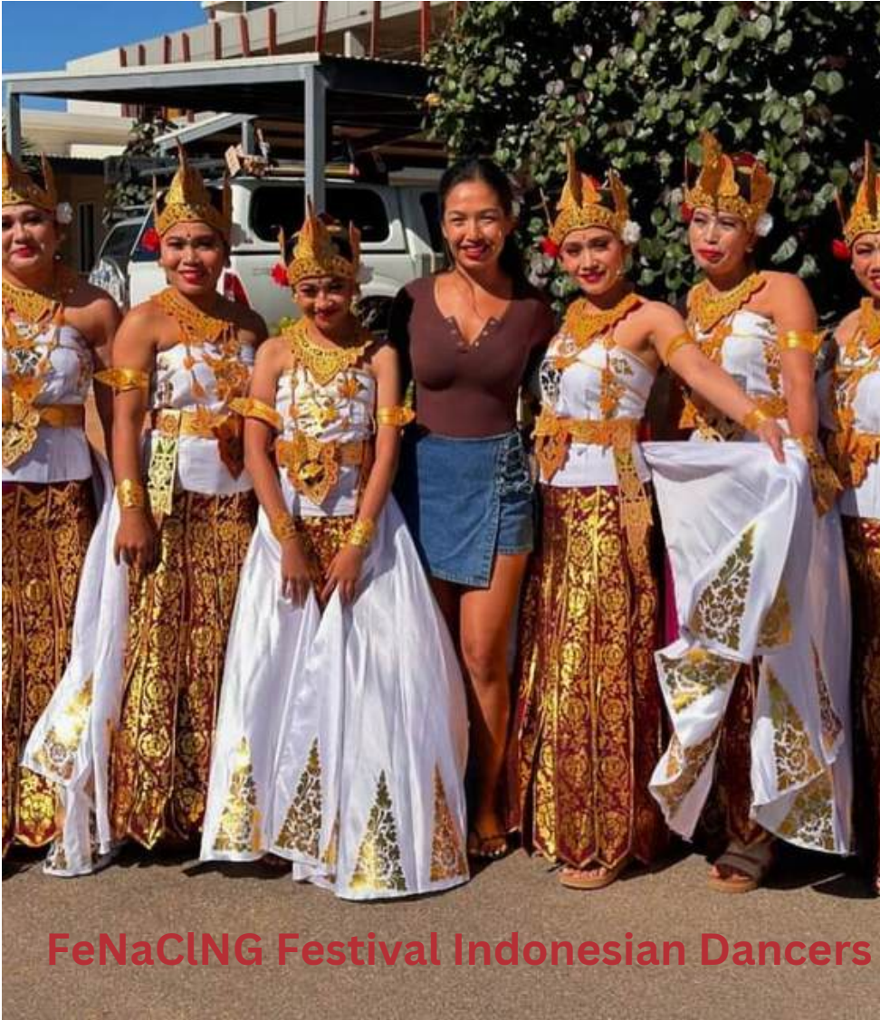
FeNaCING Festival Indonesian Dancers