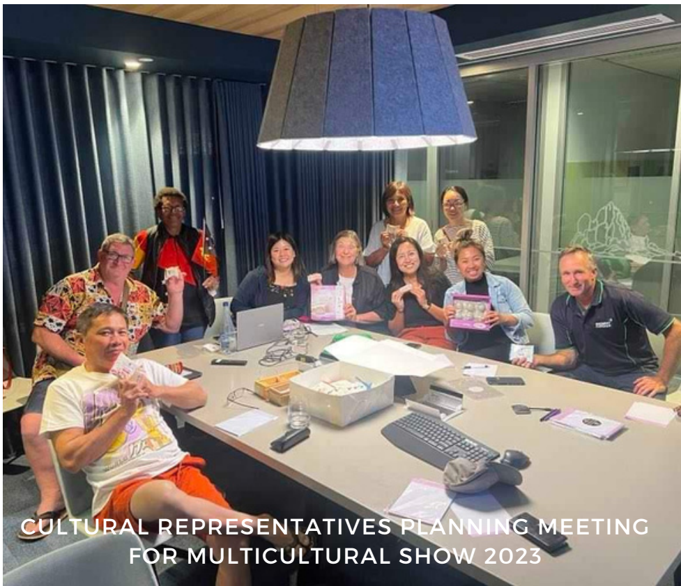
CULTURAL REPRESENTATIVES PLANNING MEETING FOR MULTICULTURAL SHOW 2023

For more information, please contact us at admin@nmawa.org.au .