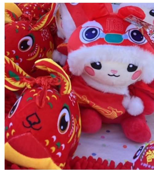
Dampier Beachside Markets fun for Dragonboat Day with our volunteers Ann and Eddie