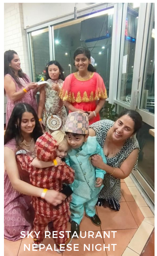
SKY RESTAURANT NEPALESE NIGHT