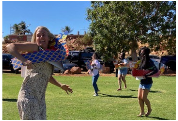
Competition was fierce for the Dragonboat races and there were prizes for the winners.