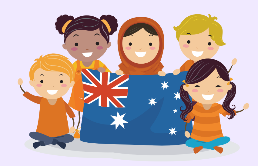
MARCH Harmony Week Multicultural Exhibition