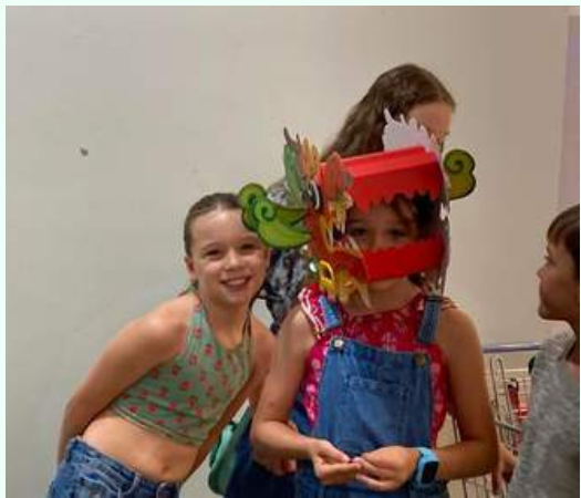
Local community enjoyed the events