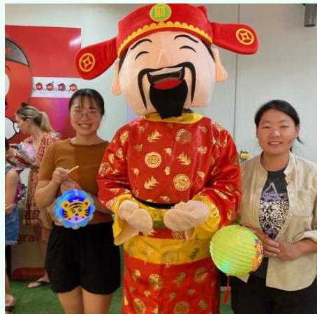
Lovely volunteers posing with Cai Shen