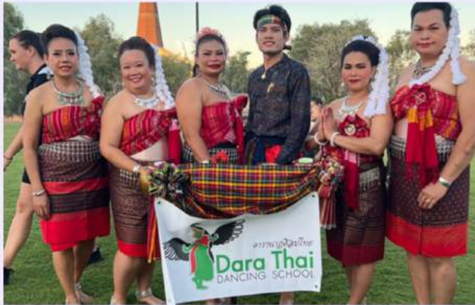
Pictured: Dara Thai Dancing School ดารานาฏศิลป์ไทย