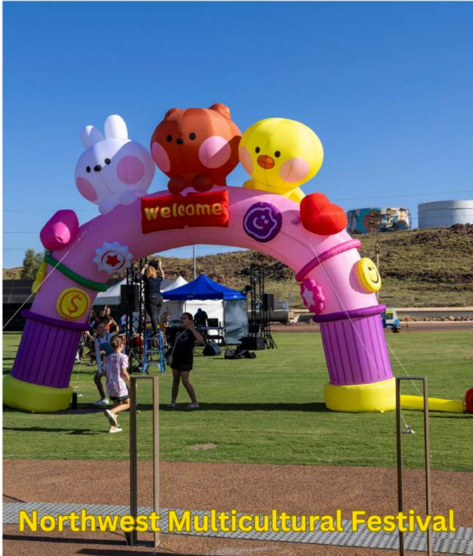
Northwest Multicultural Festival