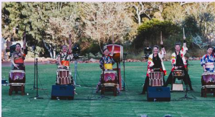
Pictured: Fabulous Taiko On Perth 太鼓音