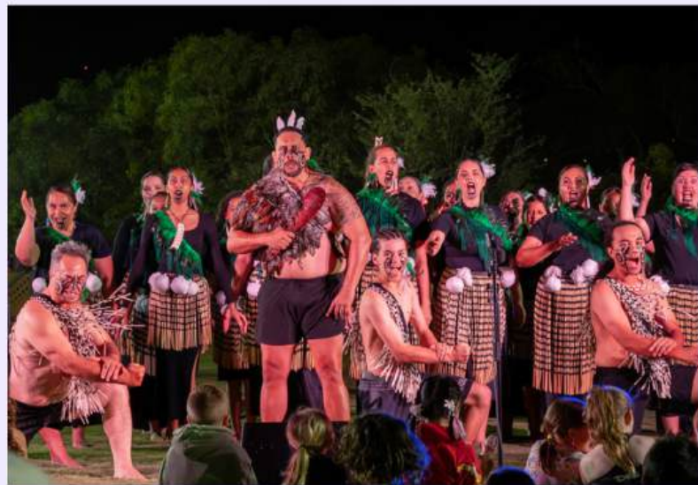
Pictured: Awe inspiring Te Ropu Kapahaka O Mauru