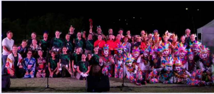
Group shot of the performers at the end of the Festival