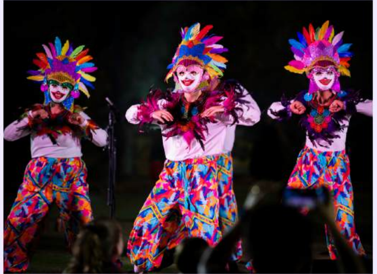
Pictured: Colourful Philippines Maskara Dancers