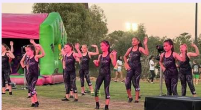
Pictured: High energy from talented Dance Kix team