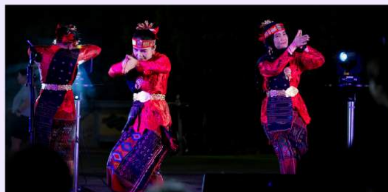
Pictured: Charming Indonesian Dancers