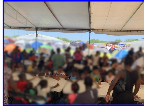
Migrant Camp Classes