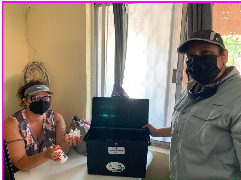
Proyecto RGV & Angry Tías Y Abuelas @ Clinic Lulu

“For months we have been unable to keep up with the medication needs that continue to grow at the pop-up clinic servicing the displaced asylum seekers. "Clinic Lulu" has given medical treatment to over 2,500 migrants to date. Haitians make up the greatest percentage of patients, here they receive quality, compassionate care with providers prioritizing language justice. Personnel capacity continues to increase as medical providers volunteer their expertise and time, but without funding we cannot fill the prescriptions. There has been a desperate need for the money necessary to purchase medication. We are appreciative of the generous contribution that will help us ensure the proper treatment plan is followed for each asylum seeker that entrusts us with their physical wellbeing.”