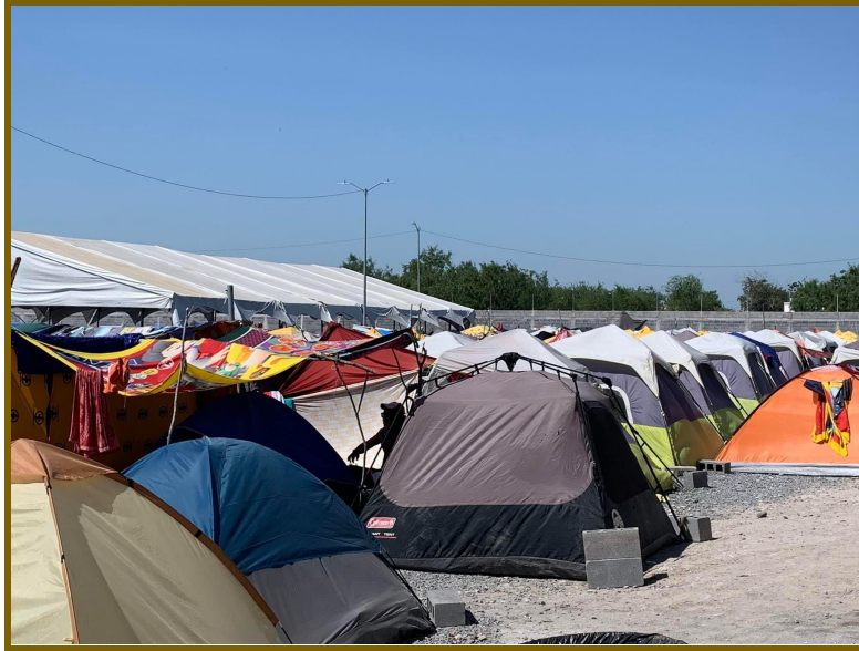
Migrant Camp US Mexico Border

We wanted to share with you some of the conversations we shared with the asylum seekers. They are all quick to share about their hopes and dreams. We are truly inspired by their positive attitude in the midst of so much despair: