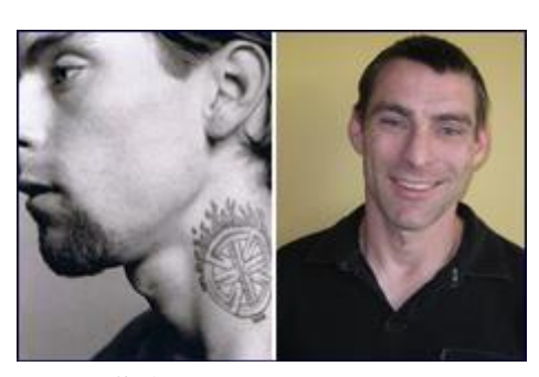
From Skinhead to Jew

Each bachur was assigned a card, on which the rav would write the results of each exam. At the end of the semester, the rav would write each boy a letter, along with a copy of his card, summarizing his achievements. The most advanced students often received an approbation designating them as "chaveir" or "moreinu" - titles of distinction. One would be hard pressed, I believe, to find present-day yeshivos where testing and examination is taken so seriously and with such intensity. (www.Torah.org)