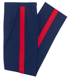
Women's Dress Blue Trousers