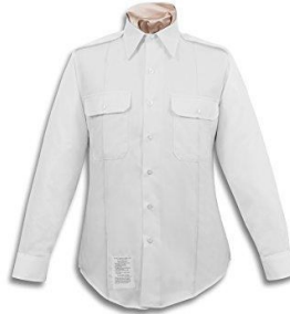
White Long Sleeve Aviator Style