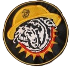
MODD Cover Patch