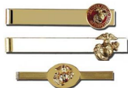
All three Tie Bars Are Authorized