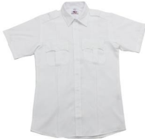
White Short Sleeve Aviator Style