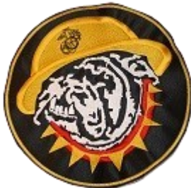
MOOD Cover Patch