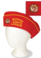
Associate Cap Ornament