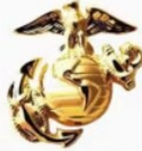
Regular Member Cap Device