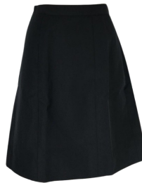
Female Black Skirt