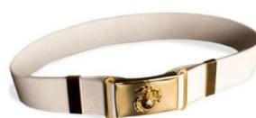
Regular Member White Duty Belt