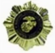
Associate Member Cap Device