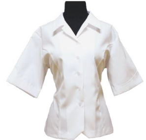
Women's White USMC Style Short Sleeve