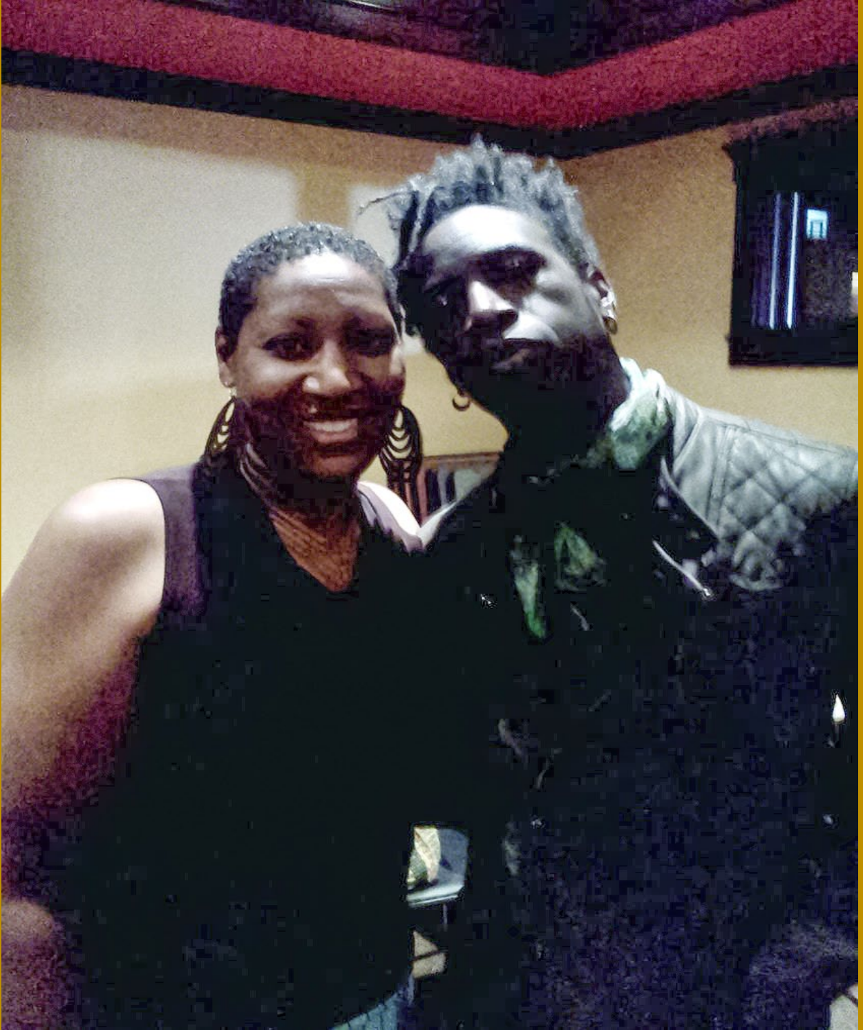
Hustle Diva and Saul Williams, UC Riverside