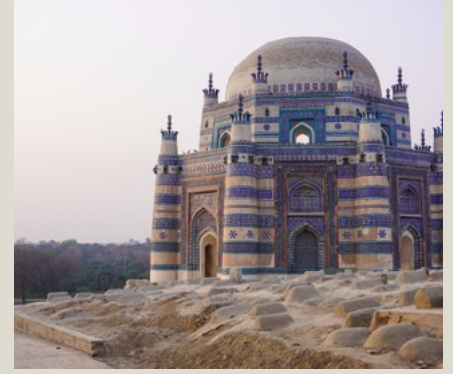
Uch Sharif Bahawalpur