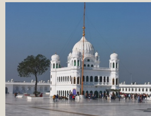
Gurdwara Darbar Sahib Kartarpur, Punjab