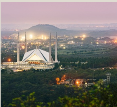
Faisal Mosque Islamabad