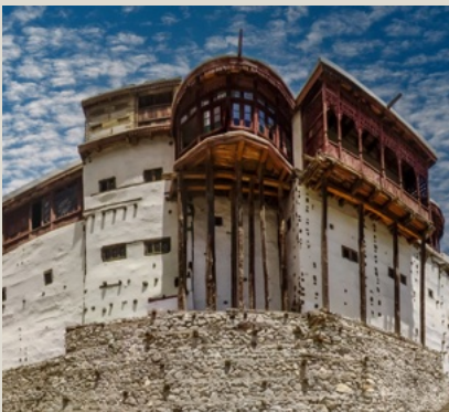
Baltit Fort Hunza