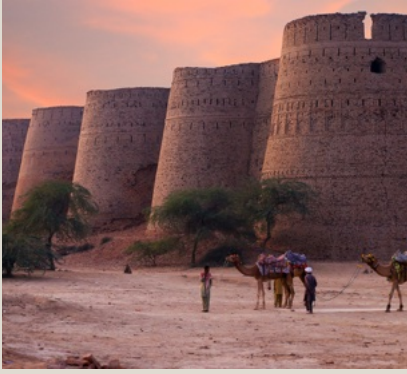
Derawar Fort Bahawalpur