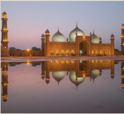
Badshahi Mosque Lahore