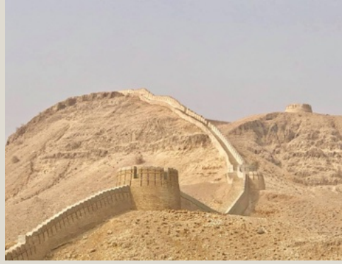
Ranikot Fort Wall Jamshoro - Sindh