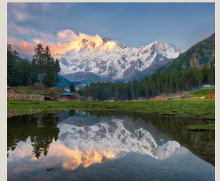
Fairy Meadows Hunza