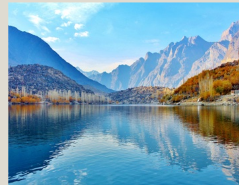
Kachura Lake Skardu