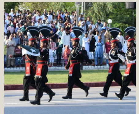
Wagha Border Lahore