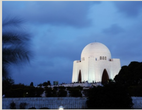
Jinnah Mausoleum Karachi