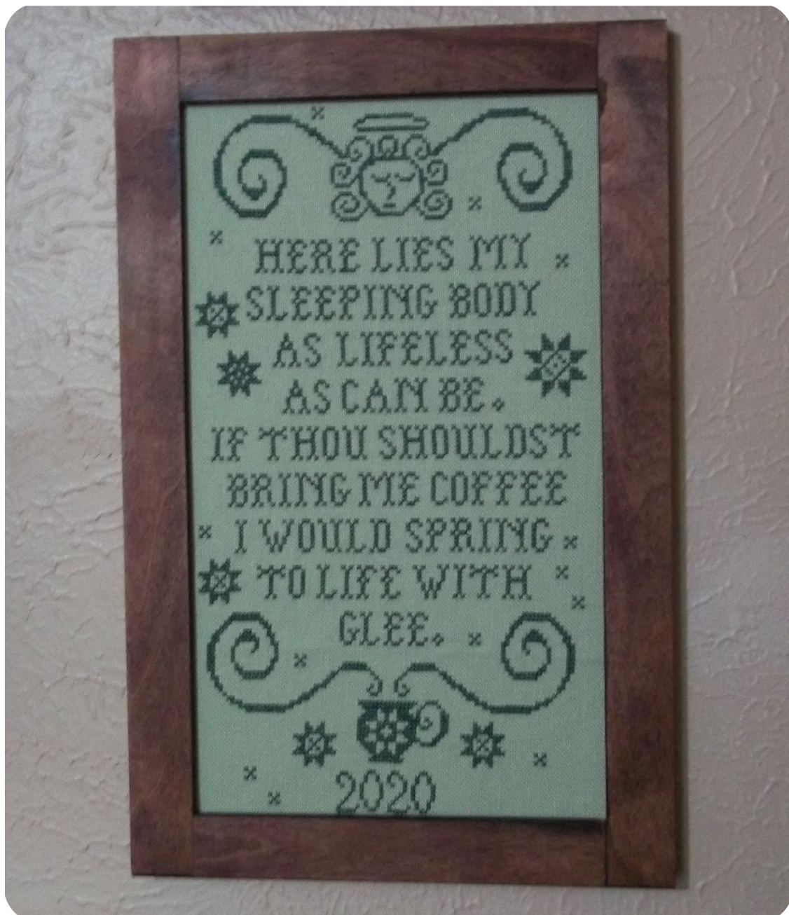
This is a free chart from Plum Street Samplers and the silk is PR111 from Silks4U.

This picture is of a Covid 19 quarantine start and finish. The chart was a freebie from Plum Street Samplers and the silk is PR111 from Silks4U.