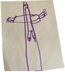
CALLIE'S SERMON NOTES & OUR QUILTERS