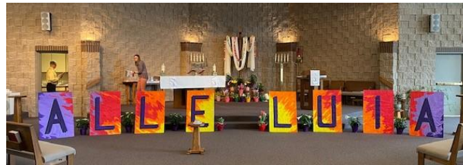
EASTER, ELIZABETH'S BAPTISM, BELL CLEANING & ADVOCATING