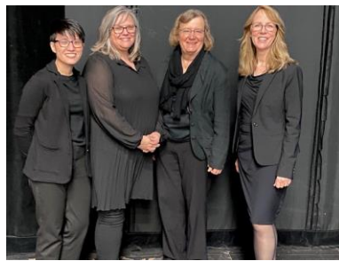
GSLC IN THE REQUIEM