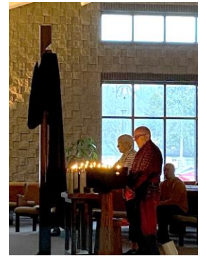
GOOD FRIDAY w/ ST ANDREW