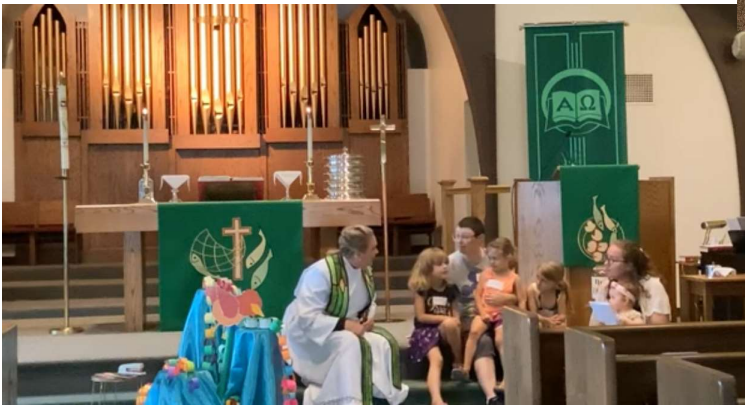
ROUND ROBIN 2 @ PILGRIM 7-28-24