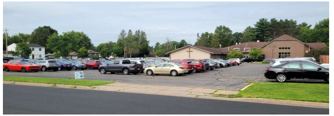
ROUND ROBIN 1 @ GSLC 7-21-24