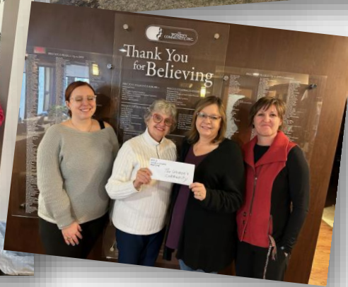
CORKS N' COVERS SHARING THEIR FUNDRAISING EFFORTS W/ NEW BEGINNINGS & WOMEN'S COMM.