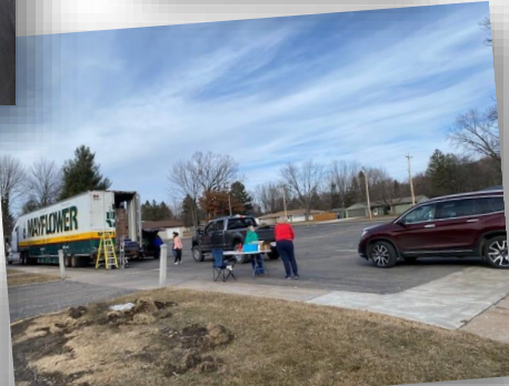
GIRLS SCOUT PICKUP SITE IN CSLC PARKING LOT