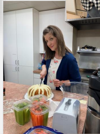
MUSIC MINISTRY NIGHT AT MIDWEEK LENT SOUP SUPPER