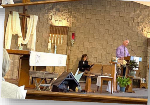
UPPER LEFT: Christ the King Sunday