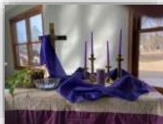
LENT 1 SNAPSHOTS

JUST. SO. MANY. MOMENTS. SO. MANY. BLESSINGS.