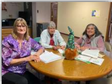
LENT MEAL PLANNING: QUILTERS