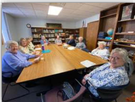
ST. STEPHEN BIBLE STUDY AFTER THE FIRST LENT LUNCHEON