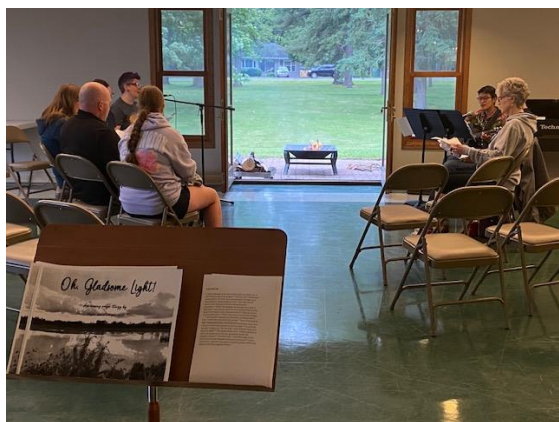
First campfire worship indoor & outdoor... Despite the rain! God is Good 😊