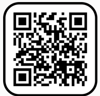
Helpful Links QR Code

Create a plan that you can use for the rest of high school. Make your own personal map for your future.