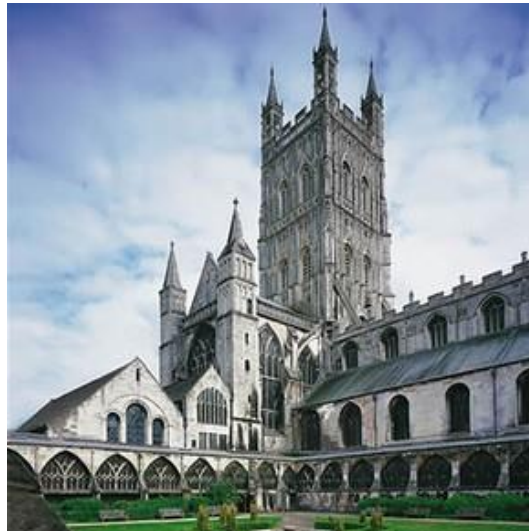
Cloister Garth, the Benedictine Abbey of St. Peter, Gloucester.

When he was about nine or ten years old, he was deemed old enough to leave home and was sent to further his education at the Benedictine Abbey of St Peter’s in Gloucester.