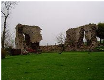
Remains of Llanddew Bishops Palace

This meant that Gerald received a house at Llanddew as his official residence and he was now free to enforce his moralising reforms on the local clergy of that part of Wales.