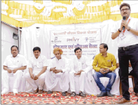
खिलचीपुर। मेले में मंच पर मौजूद अतिथि।

कंपनियों ने युवाओं को कौशल शिक्षण दिया। प्रशिक्षणार्थियों को प्रधानमंत्री ने प्रमाण पत्र वितरित किए। फर्नीचर के सामान, महिलाओं के सिले गए वस्त्र आदि की प्रदर्शनी गाई गई। संस्था सेवक ने ब्यूटी पार्लर 172, जीएसटी 170, फर्नीचर