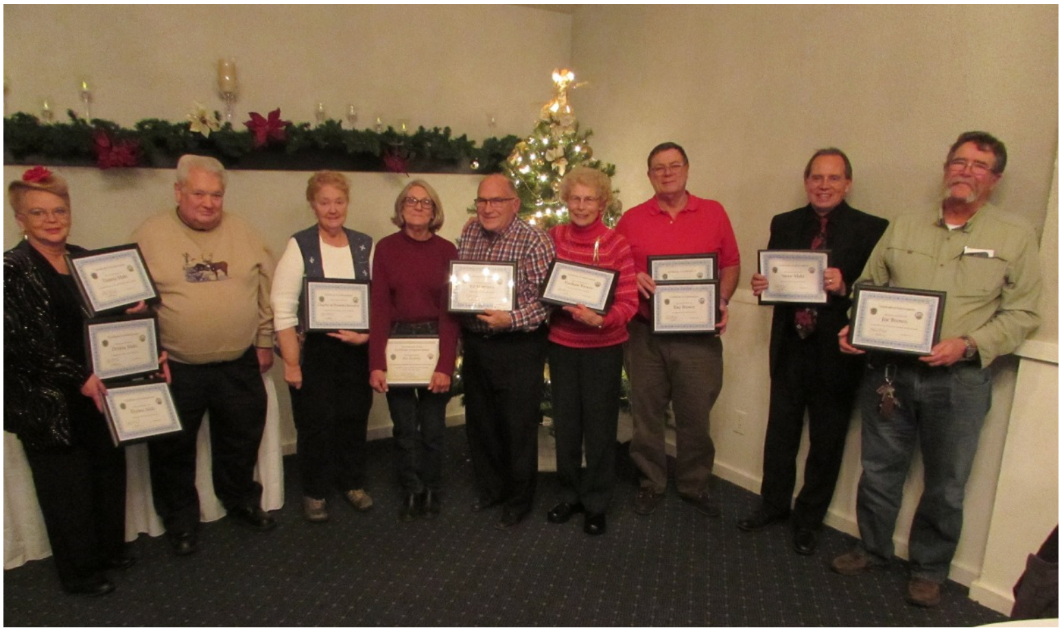
Awards A-plenty !