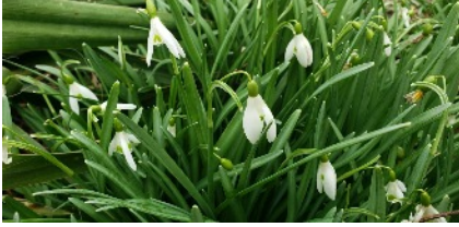
Above: Last of the Snowdrops

I took a brief peek around the yard and here are some things I found.