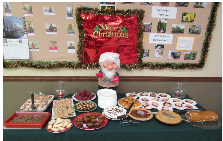
Yum, yum! Christmas goodies brought to the Christmas Party made colorful and appetizing display.

The Gardeners of America www.tgoa-mgca.org