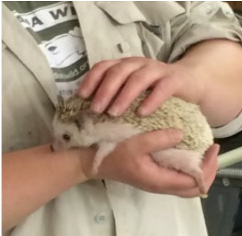
Hedgehog, a smaller type found in England or, perhaps, Africa