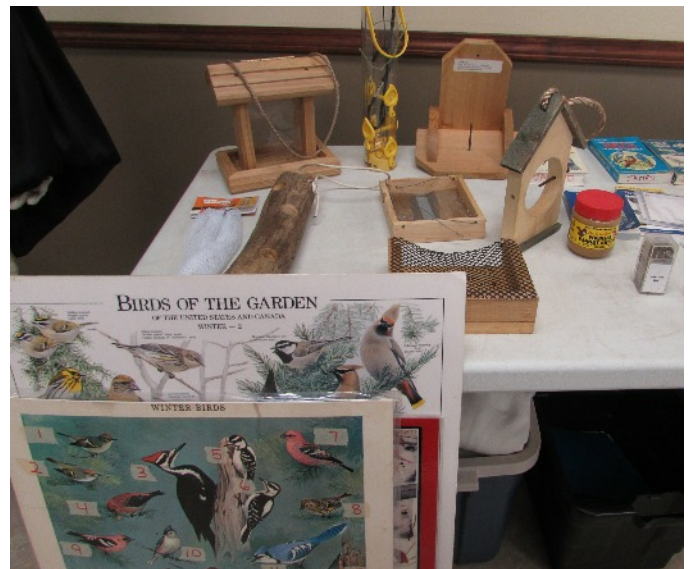
Display of items brought by Beth Thiesen, who spoke on Bird Feeding in Winter.