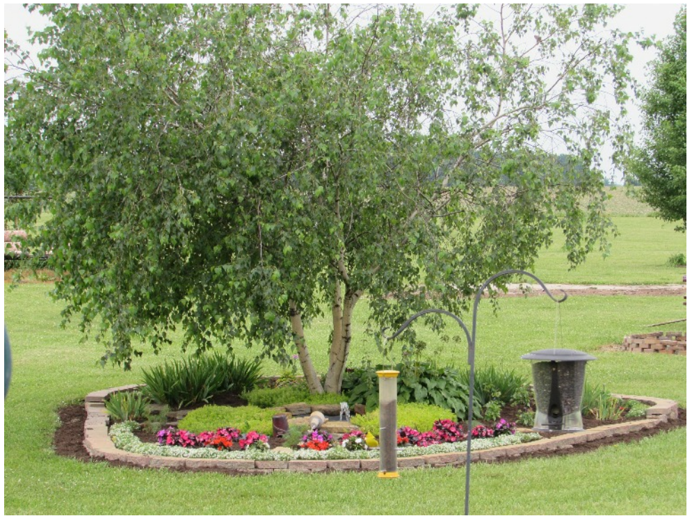
One of many flower beds in Maki yard