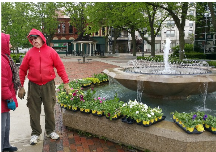
Cold & windy day for planting.