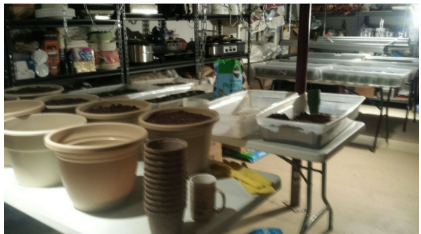
Seeds are being planted for the spring sale.