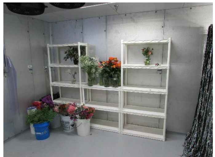
Cold storage room for cut flowers.