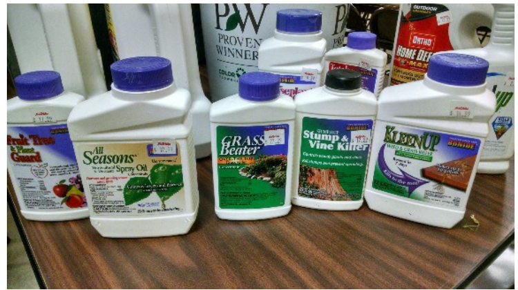
Some garden-related products from DeHaven's

As always, Tim brought a car-load of samples, both of plants and of fertilizers and pest-control products.