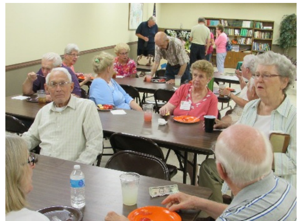
Refreshment time at the August meeting