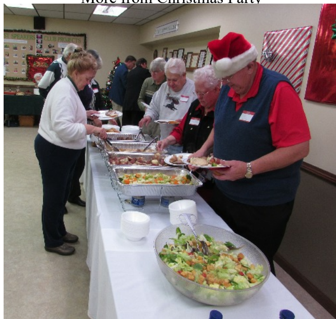
Gardeners are no strangers to the concept of "digging in." Lots of good food for everyone.