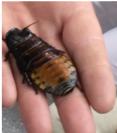
A Hissing Cockroach