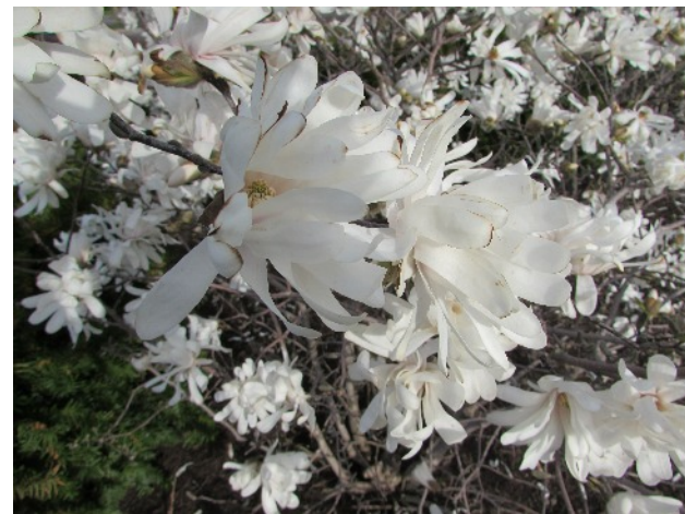
Many trees and bushes in our area display their white blossoms in the early Spring.. This bush is part of the parking lot landscaping for the 250 building, part of the St. Rita's complex.