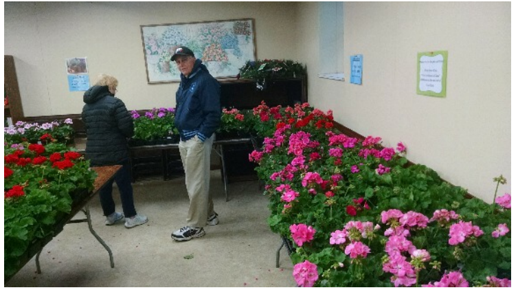
Shoppers in geranium section.