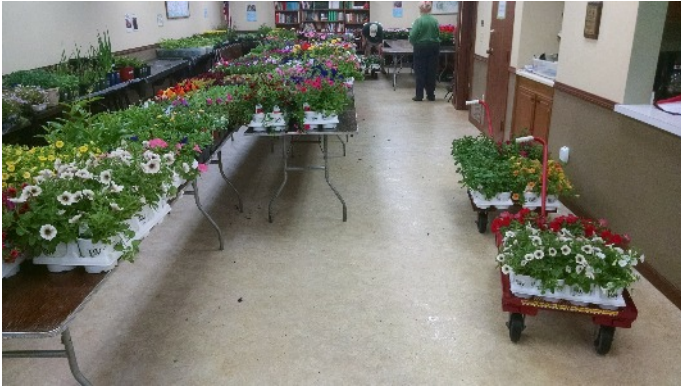
Wagons were helpful for bring plants from the truck.