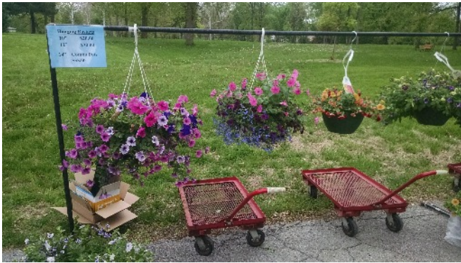
Filled Baskets and Pots were displayed out in front of the Clubhouse.