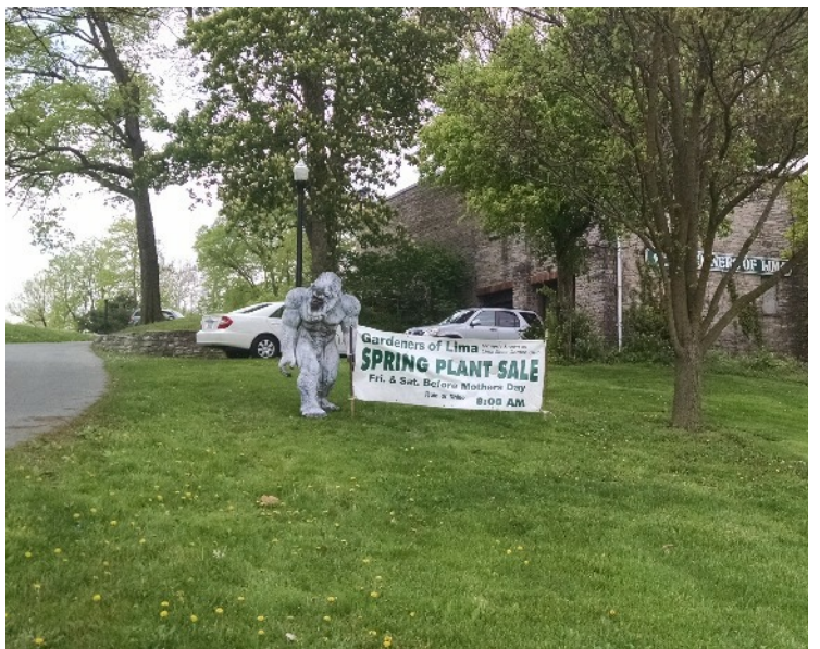
“George” took a break from the Maki gardens to help bring attention to the sale sign along the approach to the Clubhouse.