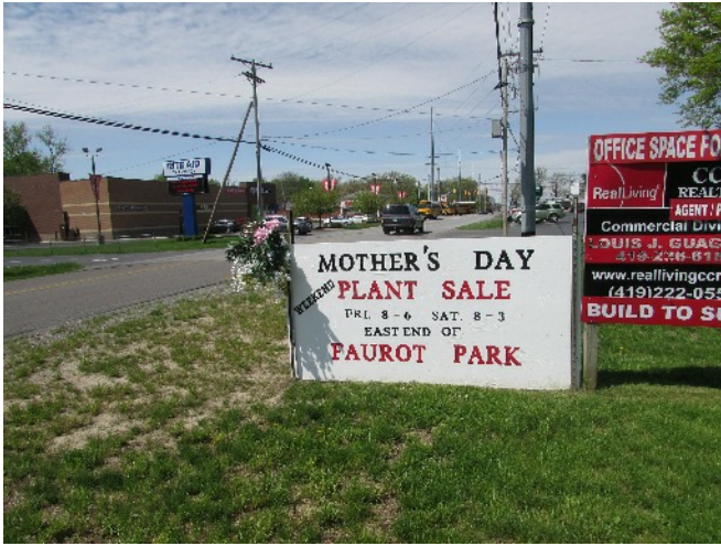
Sign posted at old location to direct customers to new location of sake.