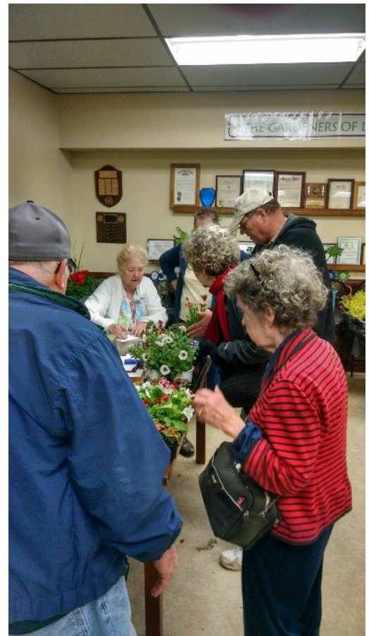
Members assisting Shoppers bringing their selections to the check-out counter.