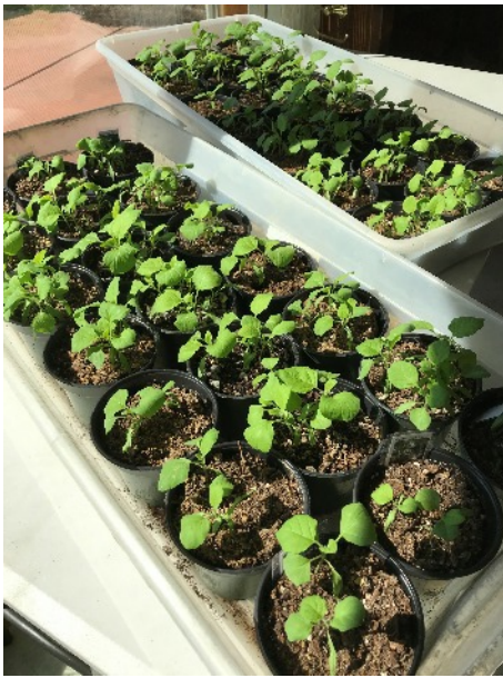
Easter Egg Plants destined for the Spring Plant Sale