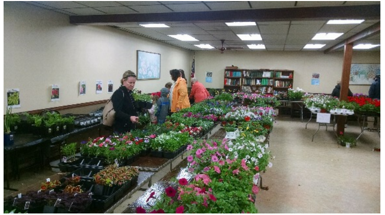
Clubhouse provided good lighting as well as warmth for shoppers as they browsed.