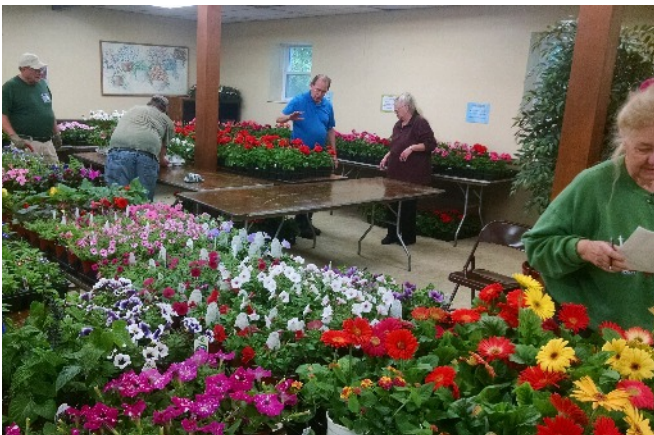
Day before the Sale, members unloaded trucks and brought plants inside Clubhouse .