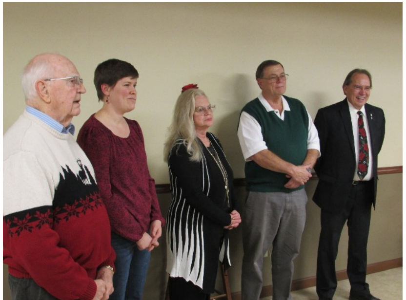
Officers of The Gardeners of Lima

After our winter recess, it'll be good to get back together with our gardening friends.