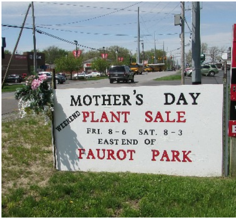
Sign at old location of Sale