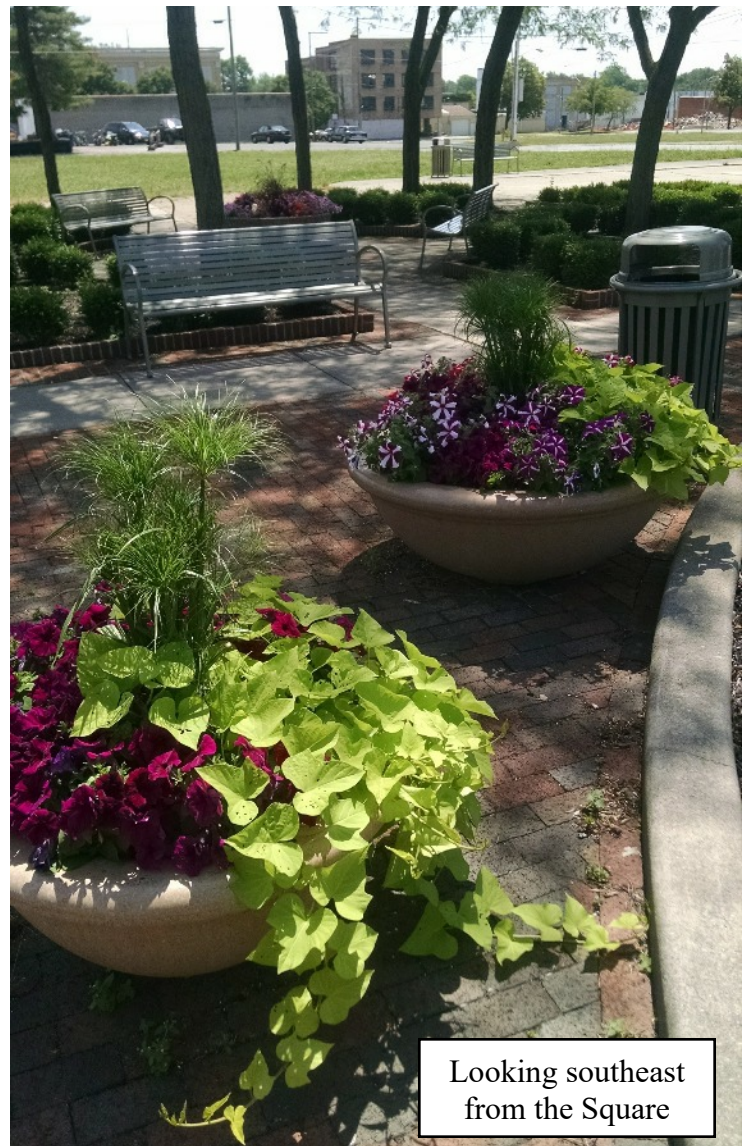
Looking southeast from the Square