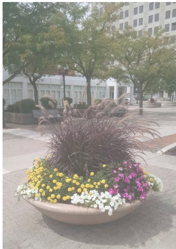
Flowers planted by members grace Lima's downtown all summer long August 2018