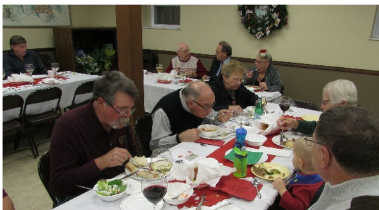
Members enjoying the banquet