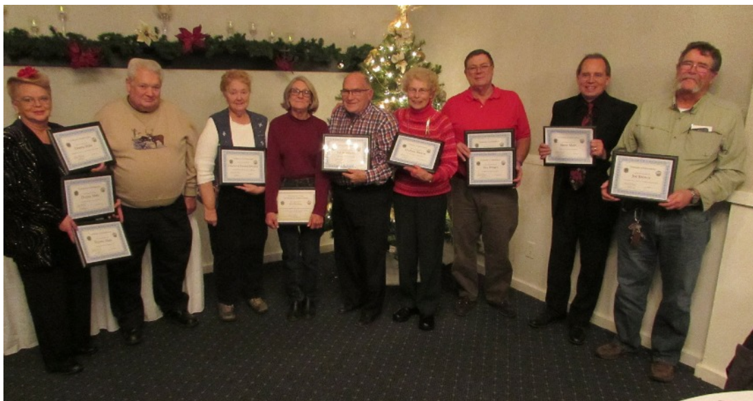
A bumper crop of awards for members December 2017