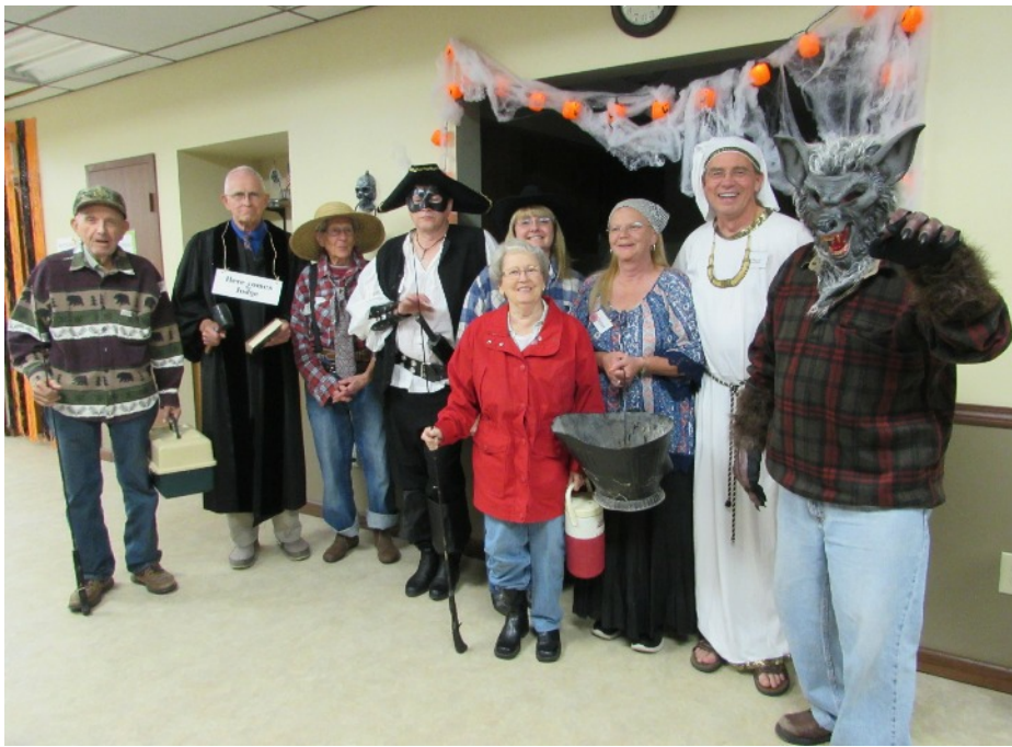
Halloween costumes October 2016