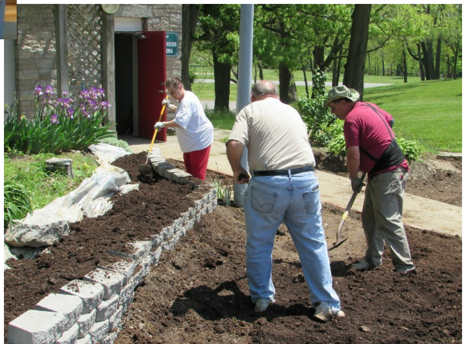
Members installing new soil at clubhouse May 2018