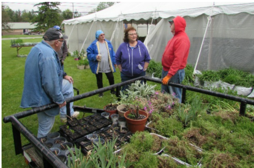
Perennials arrive for Plant Sale May 2017