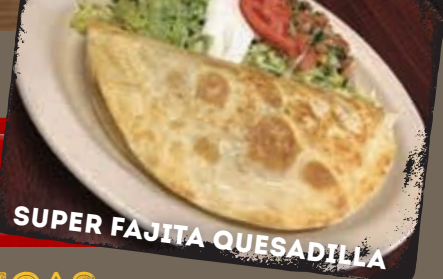
SUPER FAJITA QUESADILLA

Three cheese enchiladas topped with fajita-style chicken or steak and vegetables with green salsa. Served with guacamole salad. 9.00