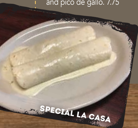
SPECIAL LA CASA

The consuming of raw or undercooked eggs, meat, poultry, seafood or shellfish may contribute to foodborne illness, especially if you have a medical condition.