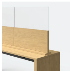
Partial height Acrylic with laminate base

(Temporarily fixed with double-sided tape)