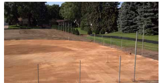
Above: field construction at Wilshire Park

The varsity baseball team had a good year in 2012 and they are returning eight starters for the 2013 season. The VFW team had a great run at the State Tournament, making the District 7 semifinals before losing to Champlin Park 3-2 and then losing to Totino Grace in the double-elimination game by the same score. In the championship game Champlin Park beat Totino-Grace 2-1.