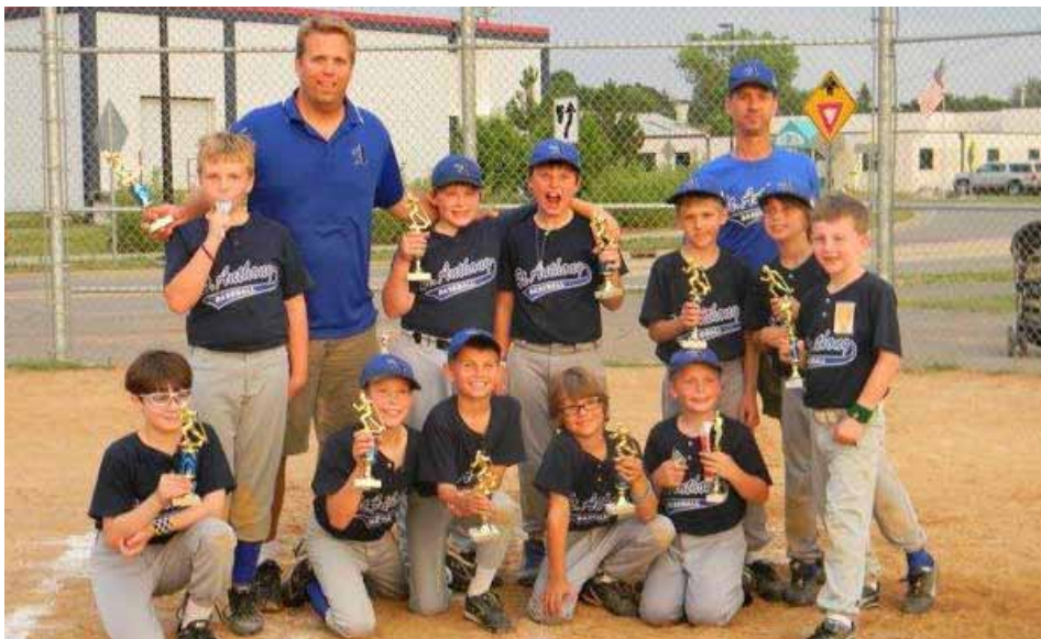
Above: the 12U Mauer Cup team hoisting their second place trophy.

You can also view the website for additional information on the 2013 youth clinics. Booster Baseball will be holding clinics for grades K through 2 nd grade and grades 3 through 8. They are tentatively scheduled for February and March 2013. Be on the lookout for registration information and clinic dates in early January 2013.