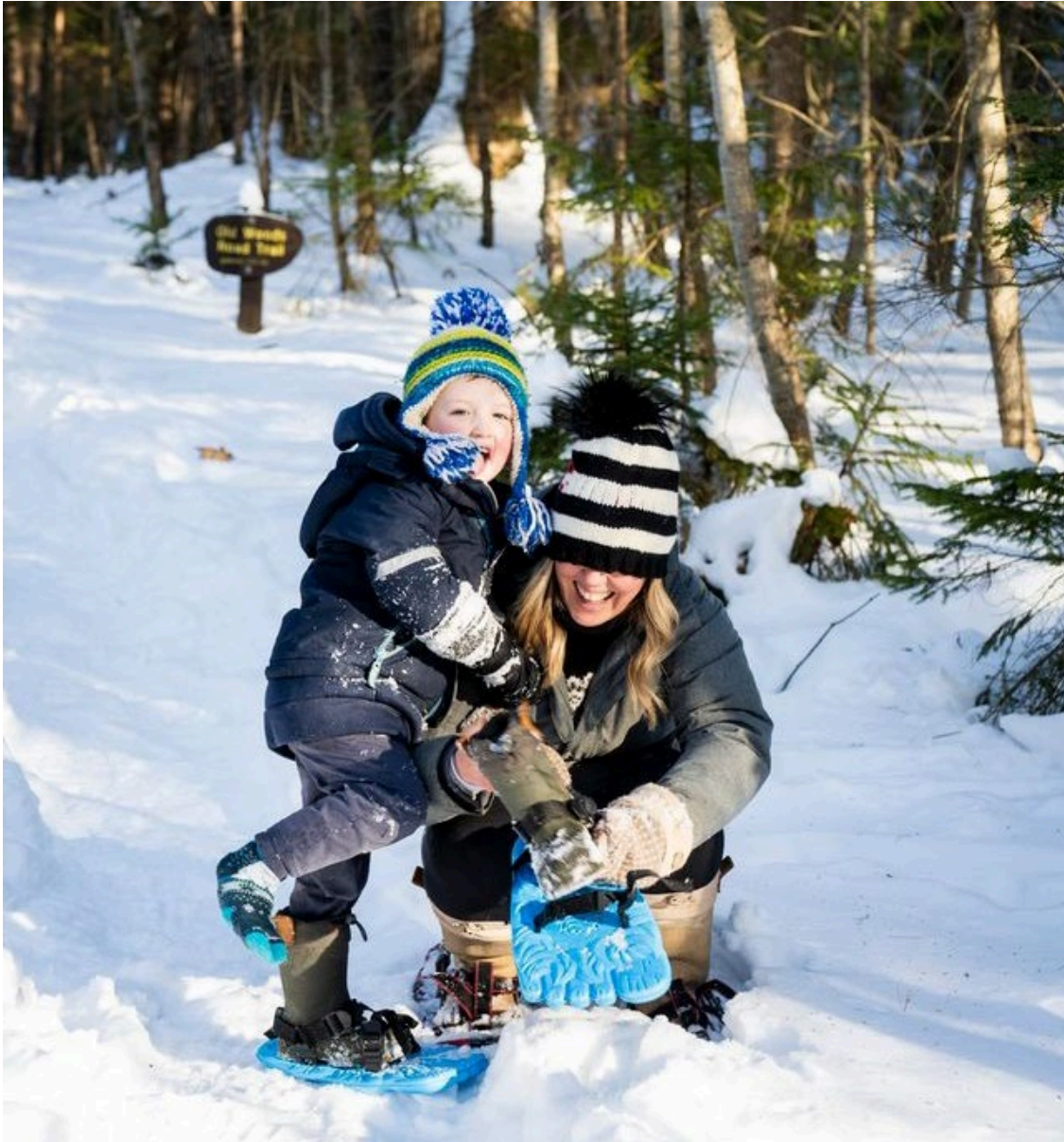
Itinerary building with Capshore