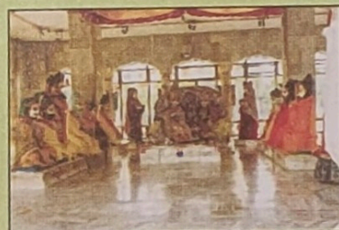
Sru Ran Suta Vivah Mandap