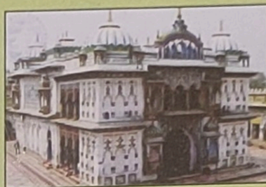
Sri Ram Mandir