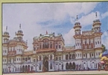
Sri Janki Mandir

The top sight seeing places in Janakpurdham are :-