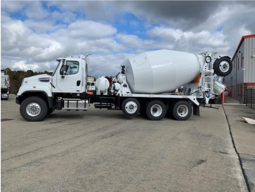
2024 FREIGHTLINER 114SD TRIAXLE w/CONTECH BRIDGEKING 11-CUBIC YARDS HIGH PERFORMANCE MIXER, 13k LIFT AXLE