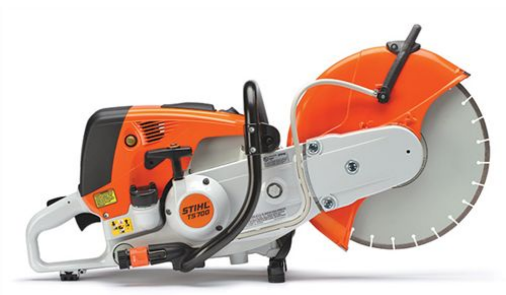
STIHL TS 700 POWERFULL CUT-OFF MACHINE & CIRCULAR SAW