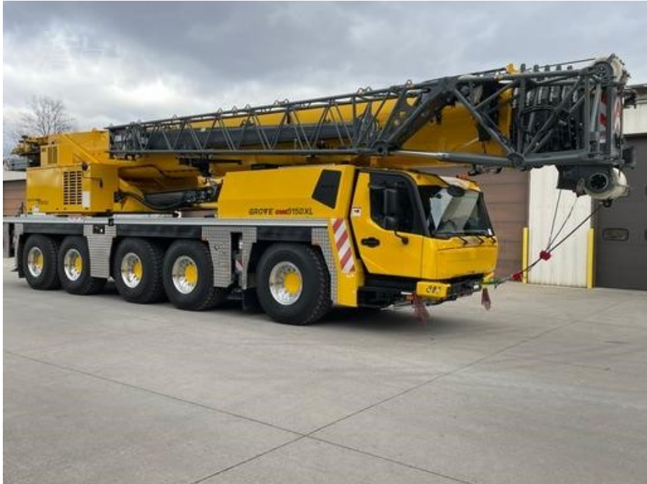
2023 GROVE GMK5150XL / BOOM 225' IN 7-SECTIONS / 20 DEGREES TILT CAB / 9-TON HEADACHE BALL / 175-TON LIFTING CAPACITY