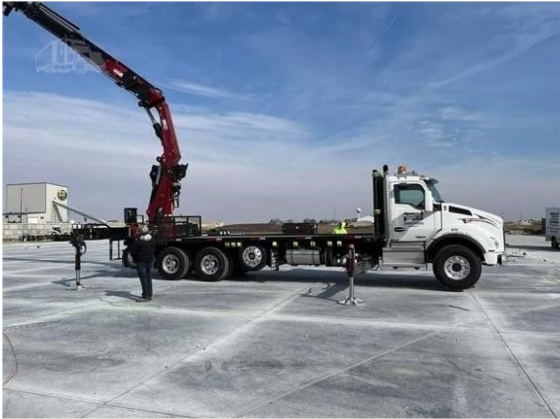
2022 KENWORTH T880 FLATBED 5-AXLE TRUCK w/BIK FORM CRANE FC-81 51-TON FOLDING HYDRAULIC 4 EXTENSION KNUCKLEBOOM CRANE, 93' VERTICAL REACH