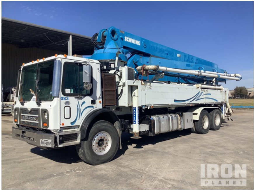
2013 SCHWING 2525H-5/3 39SX 120' ON 2014 MACK MRU613 6x4 CONCRETE PUMP TRUCK