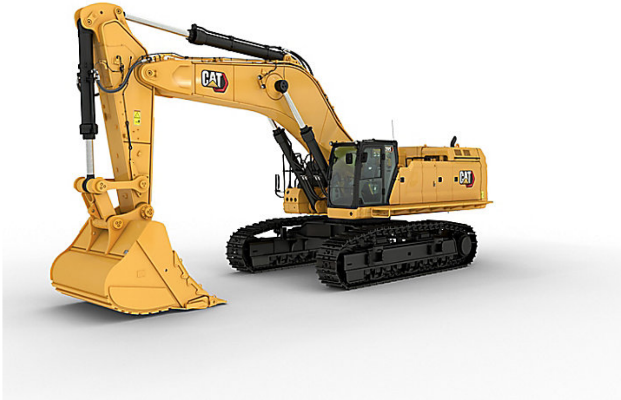
CATERPILLAR 395 HYDRAULIC EXCAVATOR