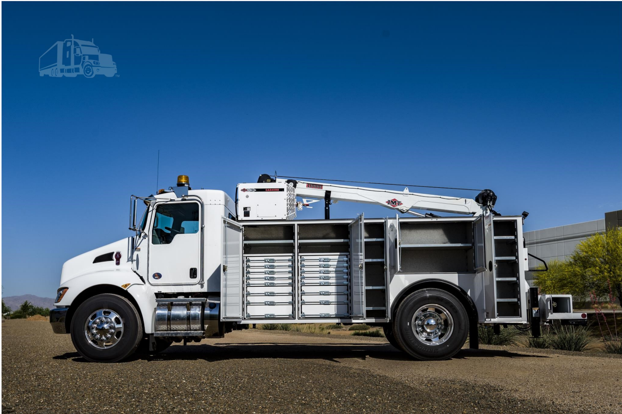
2023 KENWORTH T370 IMT 3-14" BODY, 10k CRANE, 25' REACH, AIR COMPRESSOR, TITANIUM 200 PROFESSIONAL WELDER WITH 120/240-VOLT INPUT, PREDATOR 3500 WATT SUPER QUIET INVERTER GENERATOR WITH CO SECURE TECHNOLOGY, TITANIUM 65 AMP PLASMA CUTTER