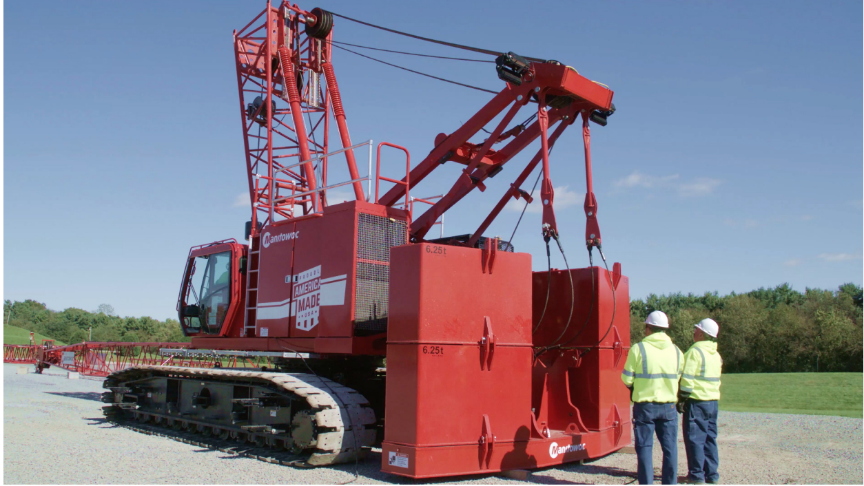
MANITOWOC LATTICE BOOM CRAWLER CRANES MLC80A-1 80-TON CAPACITY