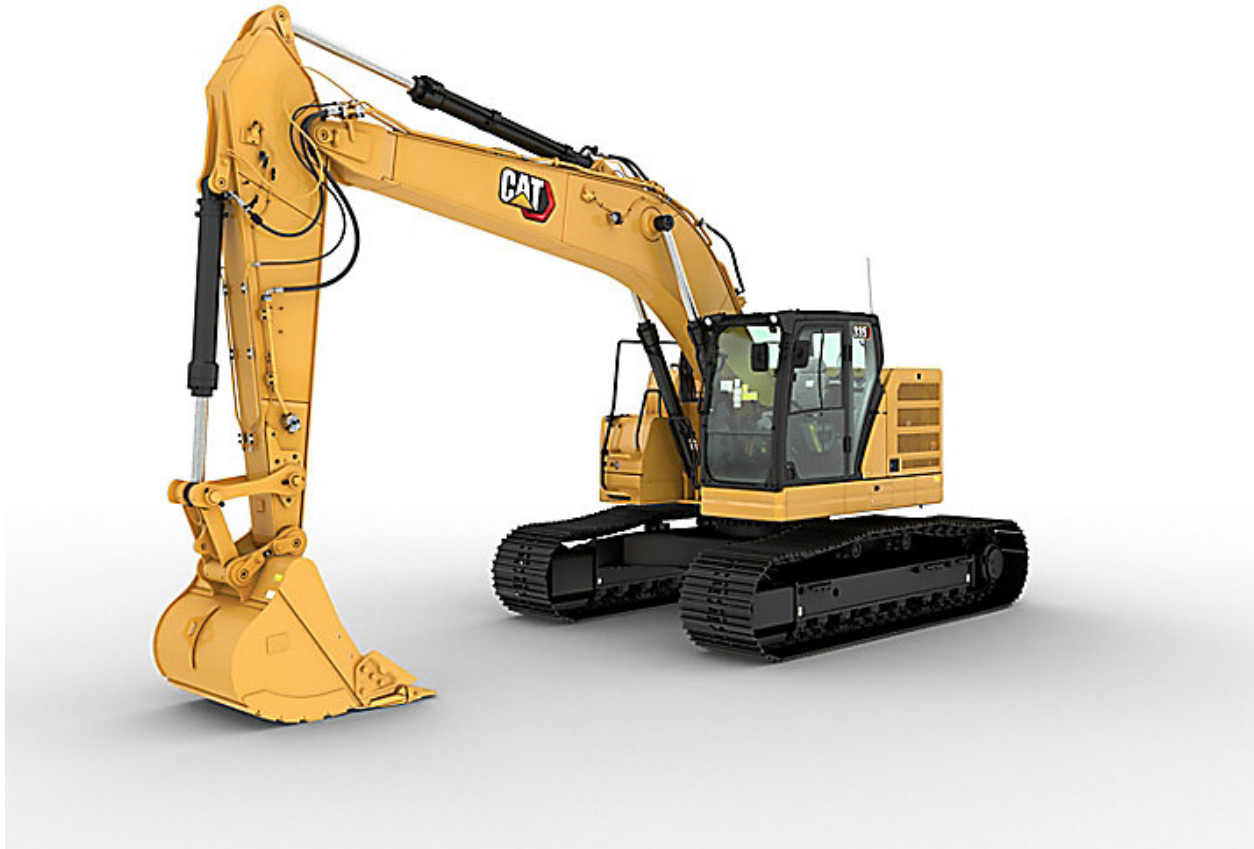
CATERPILLAR 335 ZERO TURN SWING EXCAVATOR