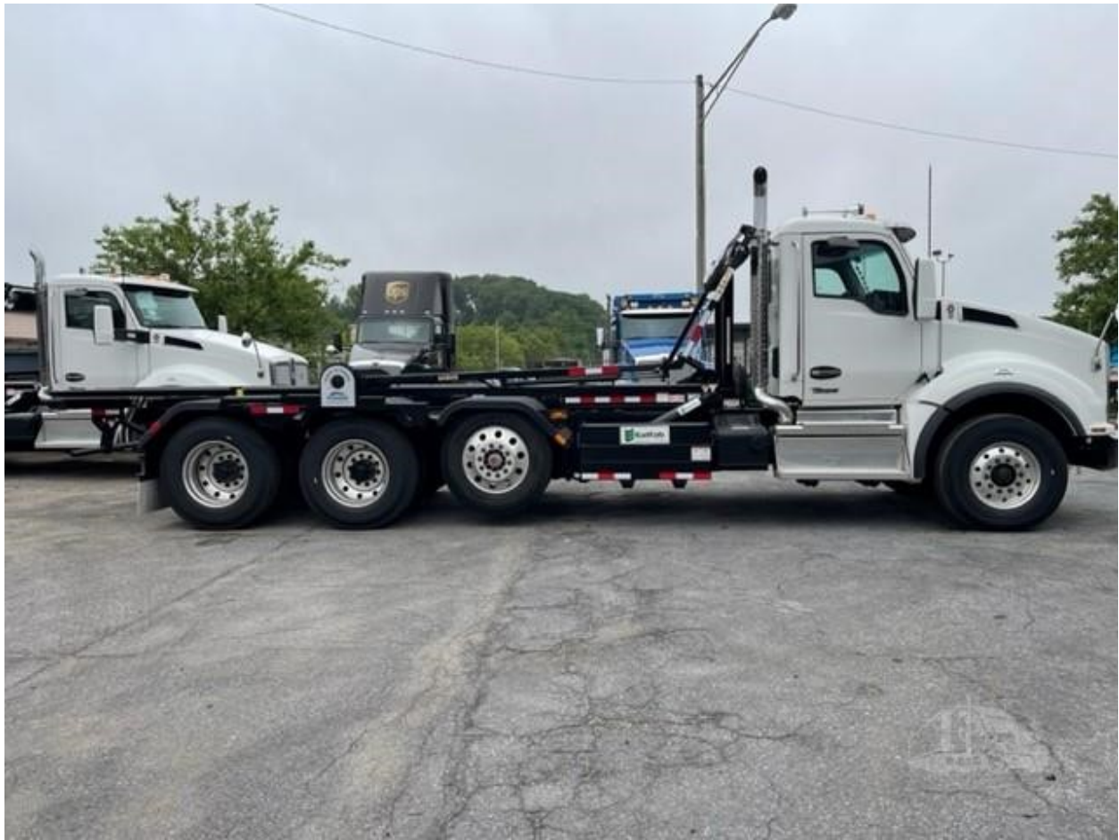
2023 KENWORTH T880 TRIAXLE ROLLOFF, 20K STEER, 13.5K LIFT, 46K DRIVES / GALFAB 75K ROLL OFF HOIST