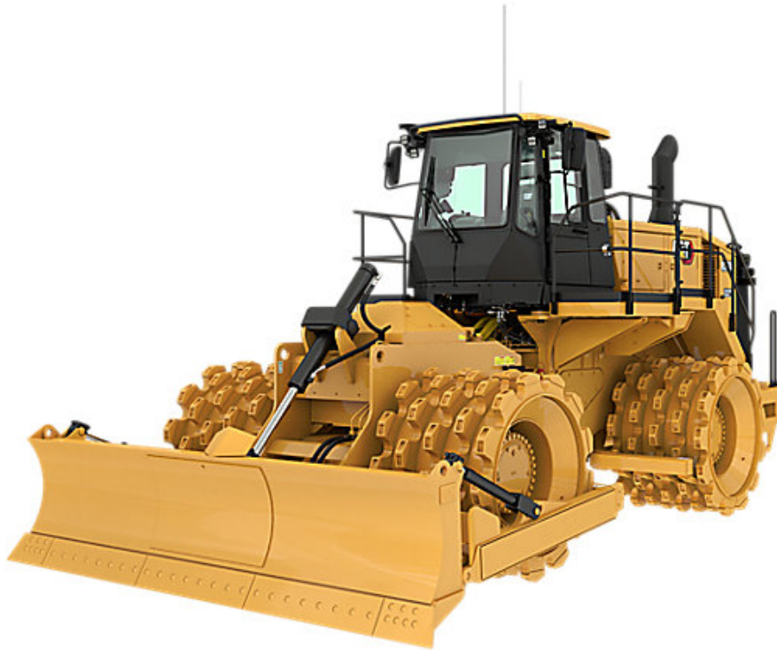
CATERPILLAR 825F SHEEP FOOT ROLLER w/BLADE