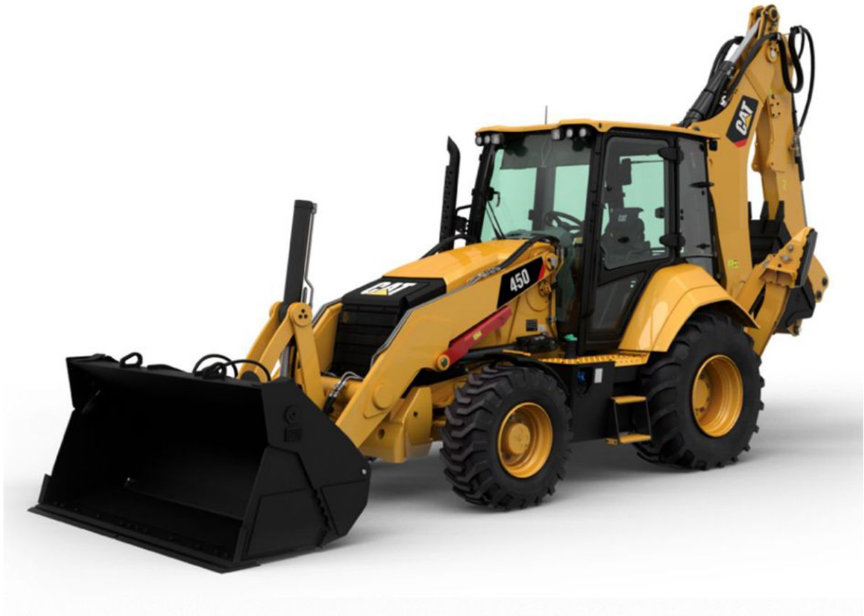
CATERPILLAR 450 PIVOT BACKHOE LOADER