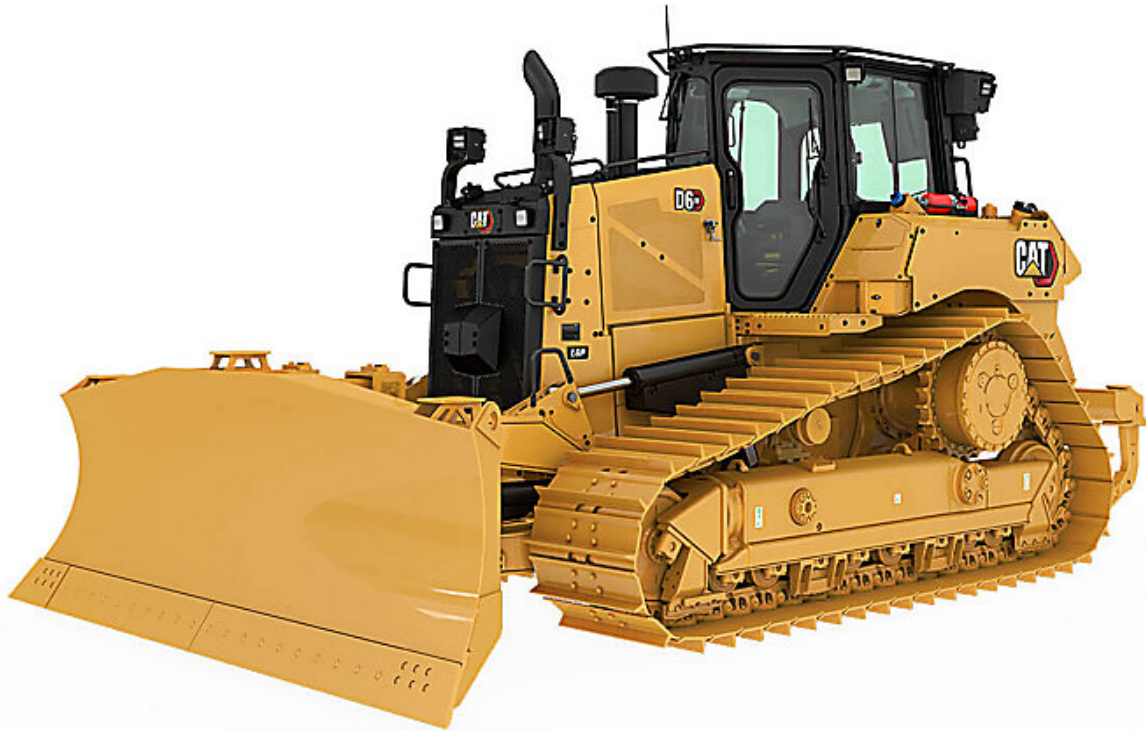
CATERPILLAR D6 XE ELECTRIC DRIVE WIDE TRACK w/12' BLADE