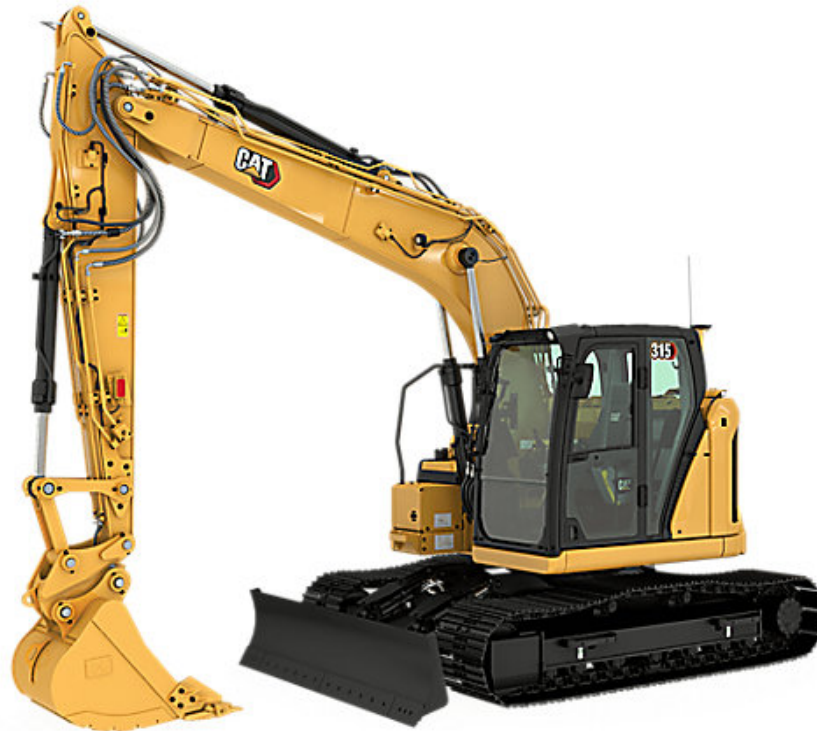
CATERPILLAR 315 ZERO OVERHANG SMALL EXCAVATOR w/BLADE