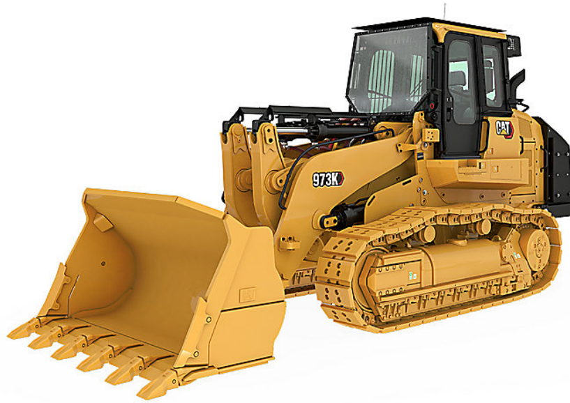
CATERPILLAR 973K TRACK LOADER