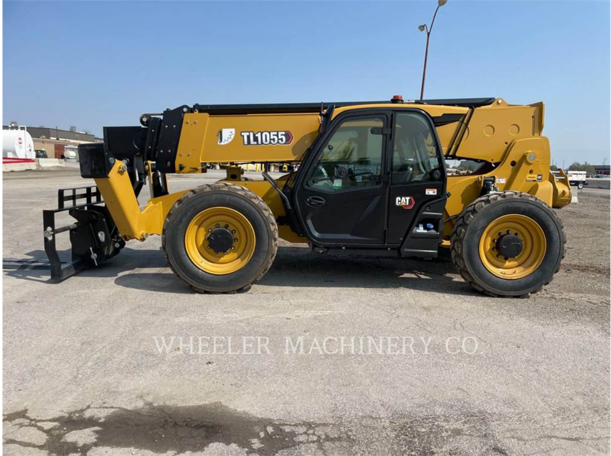
CATERPILLAR TL1055 TELEHANDLER