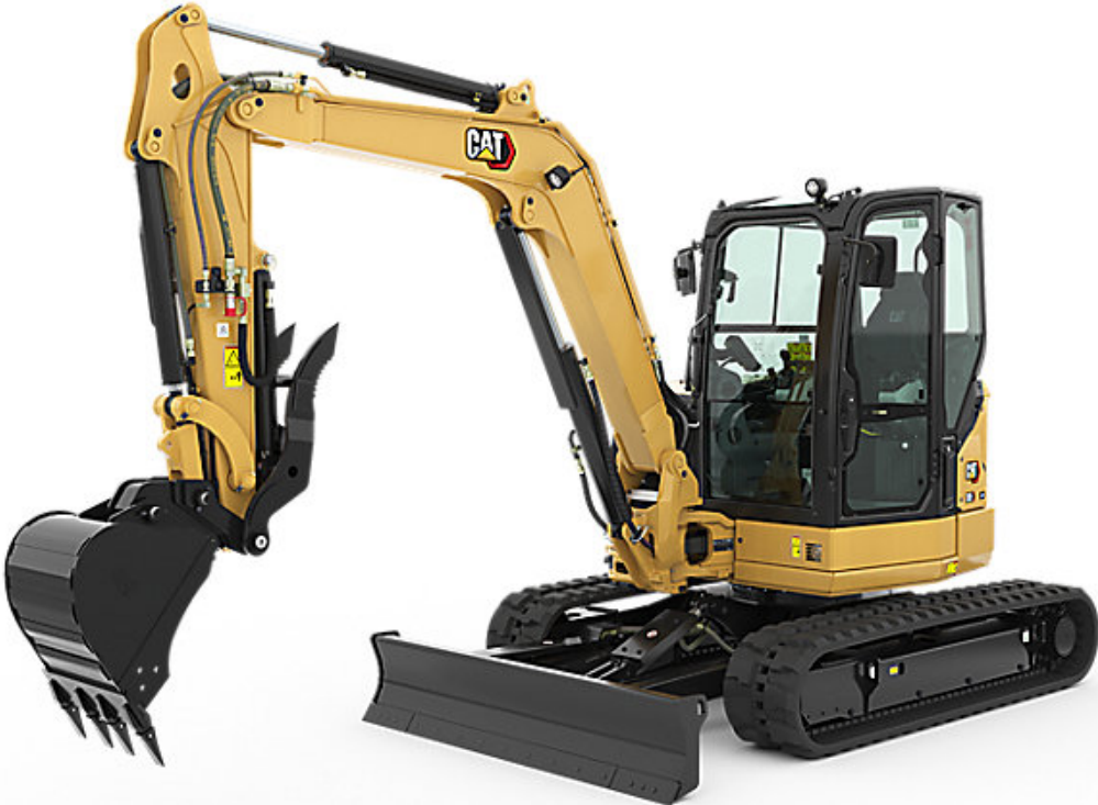
CATERPILLAR 305 CR MINI EXCAVATOR