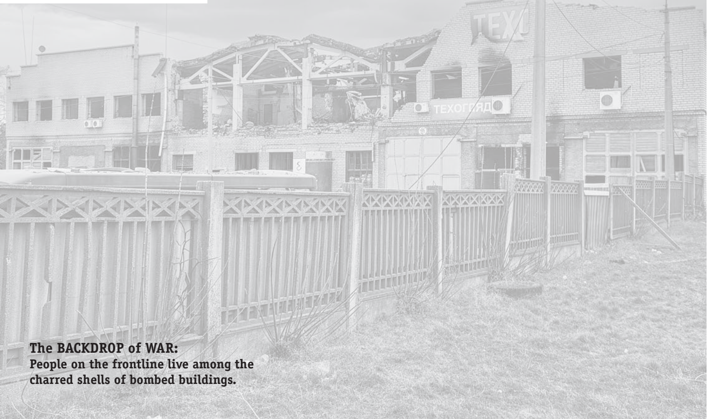
The BACKDROP of WAR: People on the frontline live among the charred shells of bombed buildings.

Common Man for Ukraine (CMFU) steps in to help bridge this gap. We focus on healing the whole family through monthly mental health retreats in Poland, giving grieving mothers and children peaceful spaces to process their loss through expert trauma counseling with Ukrainian mental health professionals. We also deliver immediate physical relief, partnering directly with Ukraine's wartime regional governments for secure access to the remote and hardest-hit communities that larger organizations often do not reach.