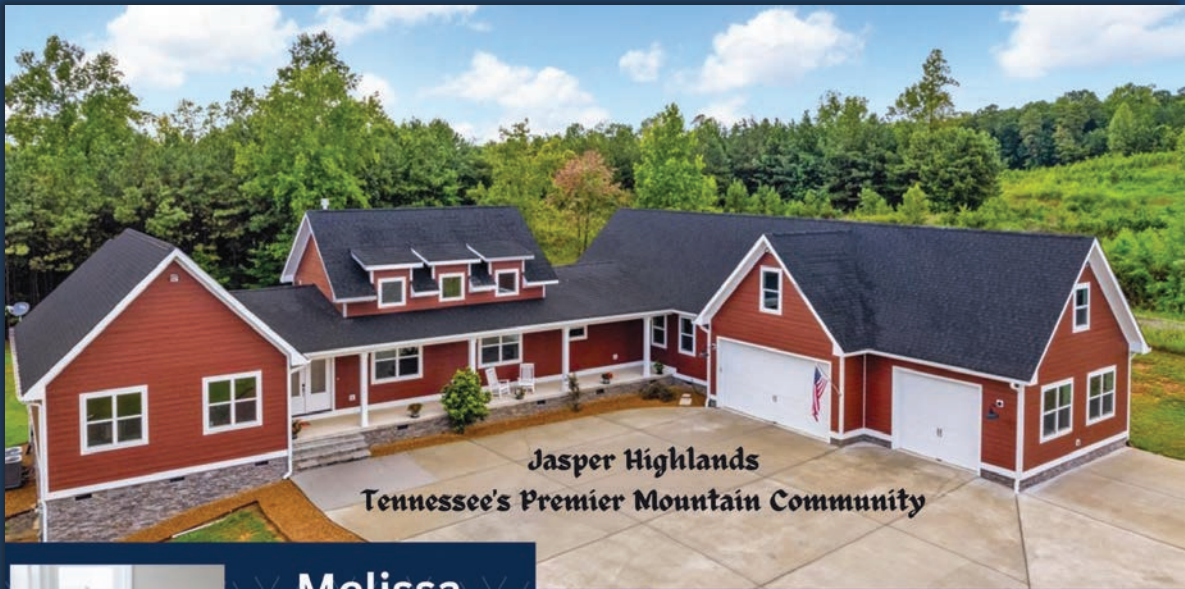
Jasper Highlands Tennessee's Premier Mountain Community