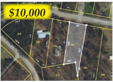
endless possibilities. Come check it out! $10,000.