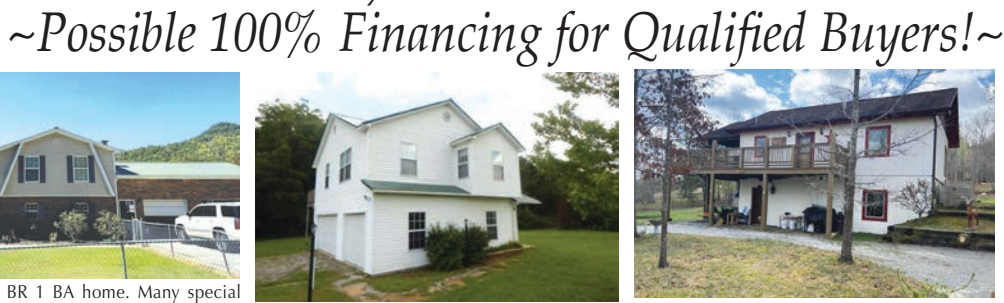
in Tracy City features custom built cabinets in the kitchen with custom built doors throughout the home. Beautiful views abound from this cozy home made just for you! $499,900.