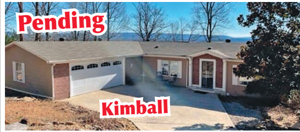
#1368278 - Beautiful view of Tennessee River and surrounding mountains. Over 1700 sq ft. 3 bedroom, 2 bath on appx 4 acres. $249,900.

#87 - Located in Downtown South Pittsburg the Former "Home" of Tails Up now available. Features 2 buildings with over 3000 sq feet of space. Many different types of uses. Call today for an appointment to view this awesome of a kind properties!