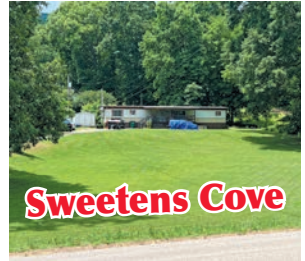
with I-24 visibility. $200k.

1 acre potential commercial lot with 1.25 acre potential commercial lot I-24 visibility. $200k.