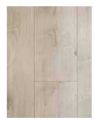
NORDIC OAK •