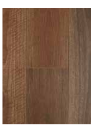
AGED SPOTTED GUM • New Arrival 2019