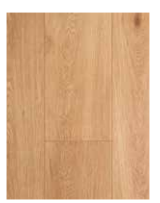
CLASSIC OAK •