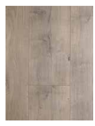
MYSTIC OAK •