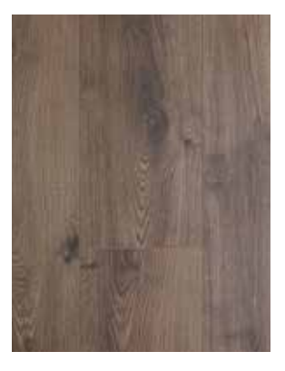
TAWNY OAK •