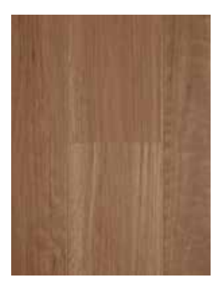
AGED BLACKBUTT • New Arrival 2019