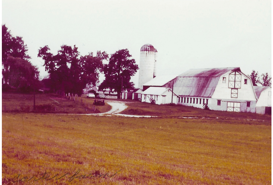
Carter Family Dairy Farm, near Rockville, MD