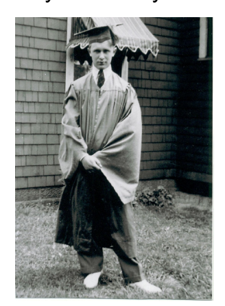
High School Graduation

"Patriotic service of this country was always foremost in his mind!"