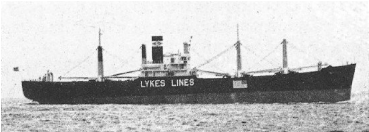
SS Louise Lykes