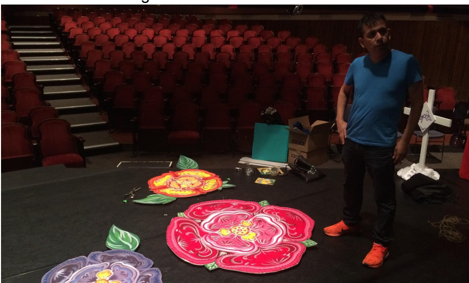
remains through the end of the show.