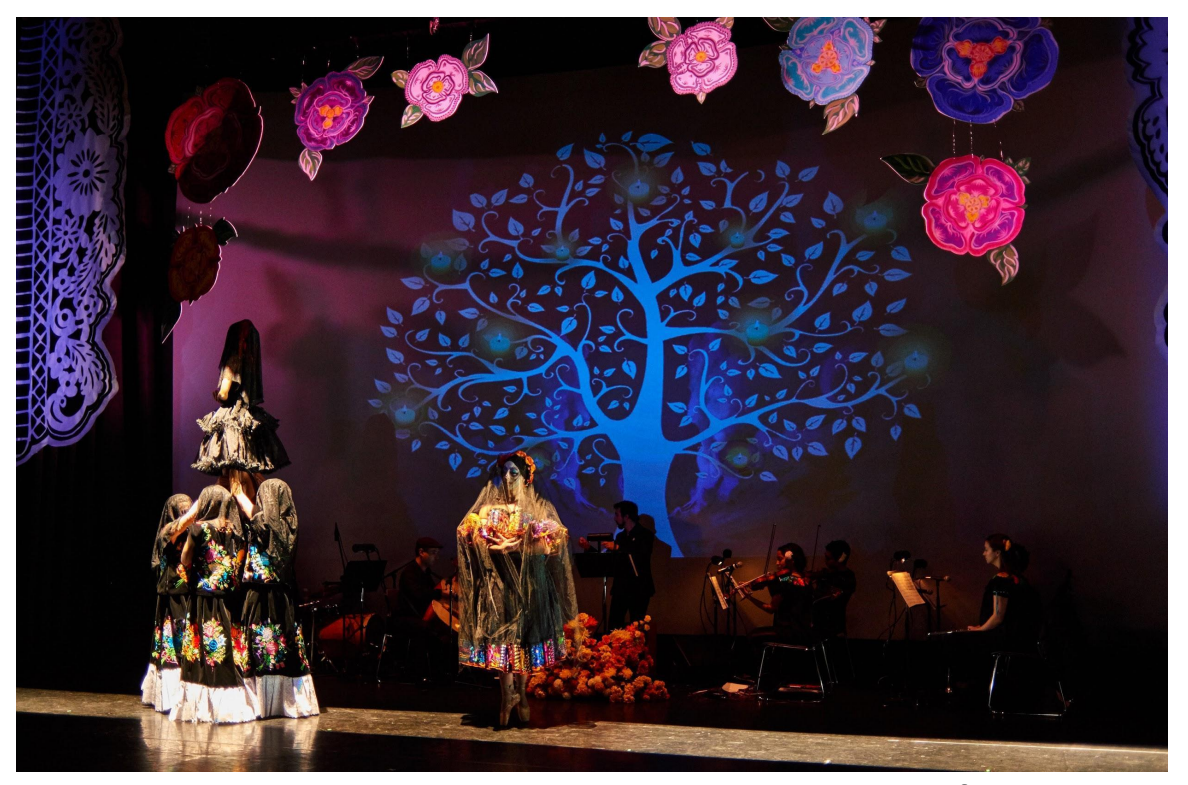
Above photo captures the lighting special and the desired scale of background projection

Path of light should cross at mid traveler level completely from one side of the stage to the other.